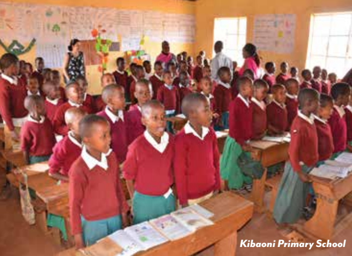
Kibaoni Primary School