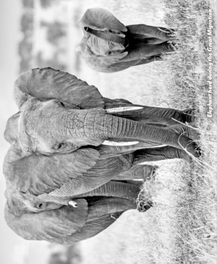
Elephant herd during the Great Migration