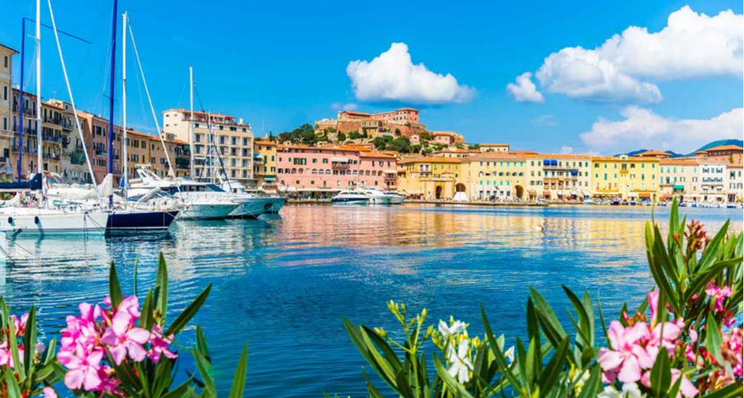
Portoferraio, Elba Island, Italy

and Napoleon's former home of Villa dei Mulini, among other historic sites. Peer through a stone gate with a magnificent sea view. Finish up with a walk along the town's splendid promenade with its exclusive shops and boutiques.