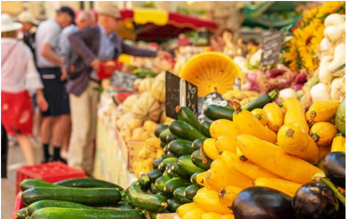
Market in Aix-en-Provence, France

From Mont Boron, enjoy an unbeatable scenic view of the Old Port of Nice, the village of Villefranche-sur-Mer, the Cap-Ferrat peninsula and the famously blue water the Cote d'Azur is named for. Continue on a panoramic tour of some of Nice's most iconic highlights. Savor a delicious lunch on board as the ship sails to Monaco. With an expert local guide, walk through the old town's charming, narrow streets, and admire the historic