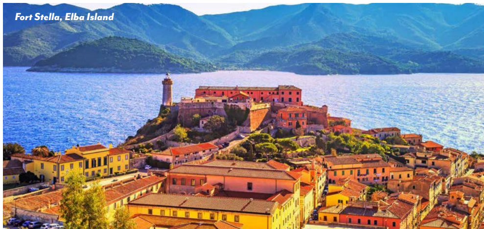
Fort Stella, Elba Island

For reservations, call Gohagan & Company at 800-922-3088 or visit gohagantravel.com/reserve