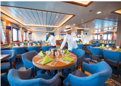
The casual dining room.

Forward lounge and bar for presentations and gatherings, restaurant, large library with Mac computer kiosks, open-air observation deck, underwater gear area and efficient Zodiac boarding platform, and open Bridge, where guests are welcome to learn about navigation from the captain and officers.