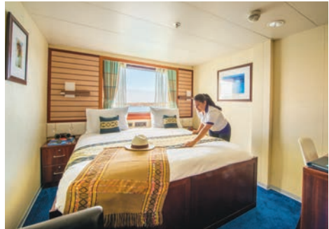
Category 4 cabin.

Served in single, unassigned seating in a sociable, informal atmosphere. Menu emphasizes Ecuadorian flair.