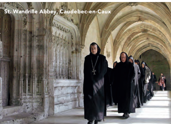
St. Wandrille Abbey, Caudebec-en-Caux

Depart for Varengeville-sur-Mer to visit a private estate, Les Bois des Moutiers, where we are invited for a light lunch. This Arts and Crafts house, designed by Sir Edwin Lutyens, sustained significant damage during the war and has since been lovingly restored. Alternatively, see the ruins of Jumièges Abbey, a Benedictine monastery founded in the 7th century, and tour the still-active St. Wandrille Abbey. Or admire the paintings collection at the Musée des Beaux-Arts André Malraux in Le Havre, a seaport city devastated during the Battle of Normandy and rebuilt in Modernist style by Auguste Perret. Return to AmaLyra for lunch. Attend an onboard lecture as we cruise the Seine River. B,L,D