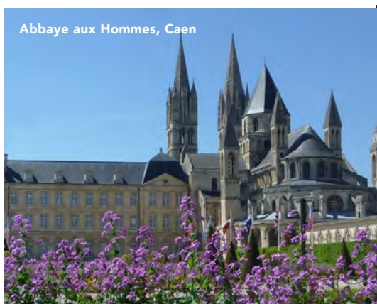
Abbaye aux Hommes, Caen