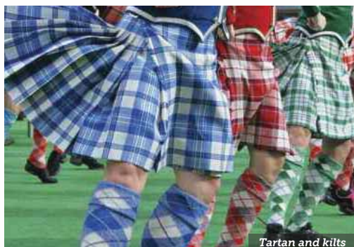
Tartan and kilts