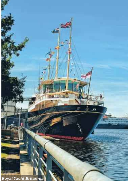
Royal Yacht Britannia