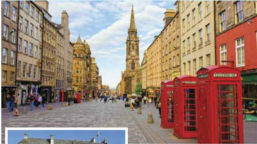
Above: Royal Mile, Edinburgh | Left: Traquair House