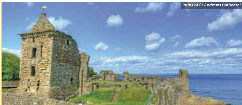
Ruins of St Andrews Cathedral

Discovery: Scottish Borders and Rosslyn Chapel. Travel through the emerald hills of the Scottish Borders, the region that adjoins England, to Traquair House, the country home of the Stuart family since 1491. After touring the stately home, sample the refreshing ales of the 300-year-old brewery on site. Continue to Peebles, a quaint town on the River Tweed, and find a cozy spot for lunch on your own. Rejoin the group and head to the exquisite Rosslyn Chapel, featured in the novel "The Da Vinci Code." Study the intricate carvings up close and uncover the myths associated with the chapel, which has been owned by the St. Clair family since its founding in 1446.