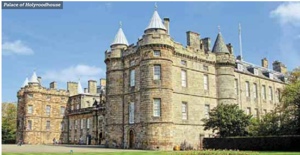
Palace of Holyroodhouse