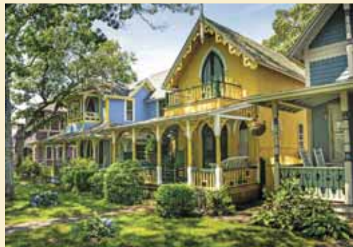
Gingerbread cottages, Vineyard Haven