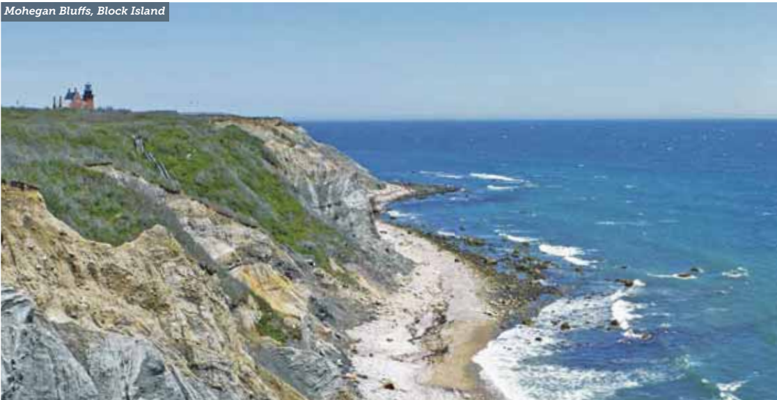
Mohegan Bluffs, Block Island