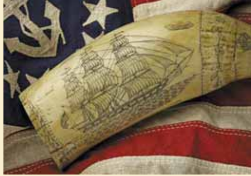
Scrimshaw, New Bedford Whaling Museum