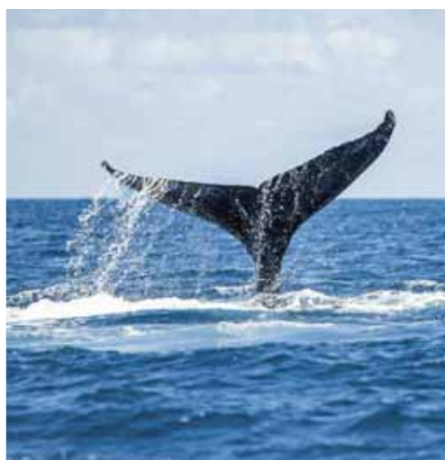
Above: Gay Head Lighthouse, Martha's Vineyard Inset: Whale breaching

Nestled within Narragansett Bay is Newport, which boasts one of the world's finest harbors and enduring sailing traditions. Newport is also