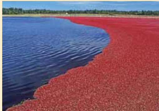
Cranberry bog, Nantucket