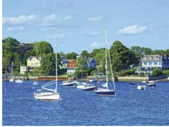
Newport, Rhode Island