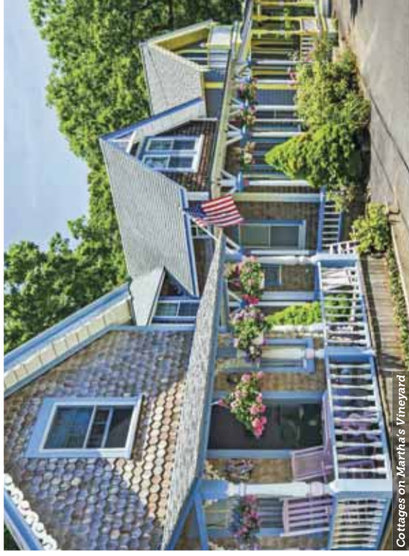
Cottages on Martha's Vineyard