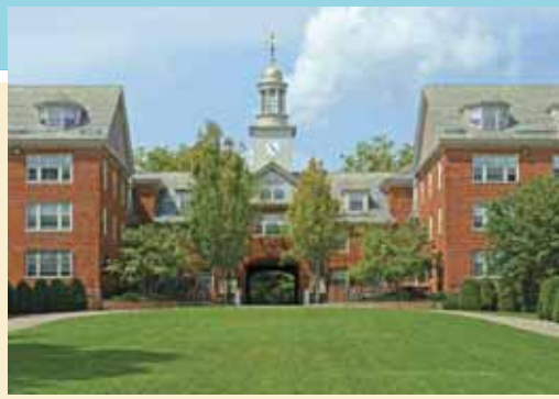
Brown University campus