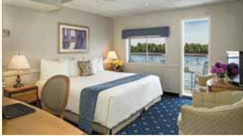
AAL-2nd Deck and AAC-3rd Deck