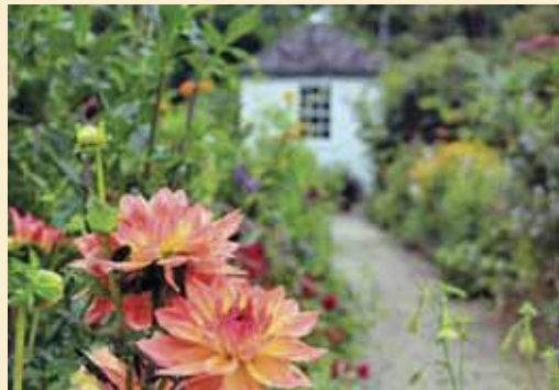
Idea Garden, Blithewold Mansion