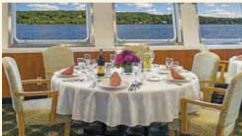
Preparation for dinner