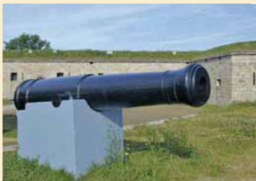
Cannon, Fort Adams