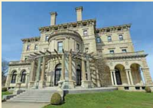
The Breakers Mansion, Newport

With your local guide, ride along the picturesque 200-foot-high Mohegan Bluffs and visit favorite spots, including the Old Harbor's boutiques and Southeast Lighthouse. Unwind with a refreshing glass of Del's Lemonade, a local summer treat.