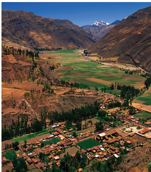
The beautiful and historic Sacred Valley

Day 16: Arrive U.S. We arrive in the U.S. this morning and connect with our return flights home.