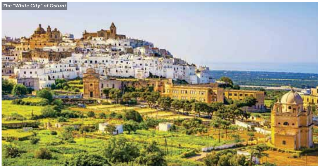
The "White City" of Ostuni