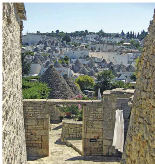
Above: Ancient Roman amphitheater and ruins, Lecce Inset: Trulli of Alberobello

Discovery: Matera. Visit Matera, a 2019 European Capital of Culture, and witness its dramatic saga of rebirth. Venture into the celebrated Sassi, prehistoric caverns and rock-hewn churches that were carved from limestone