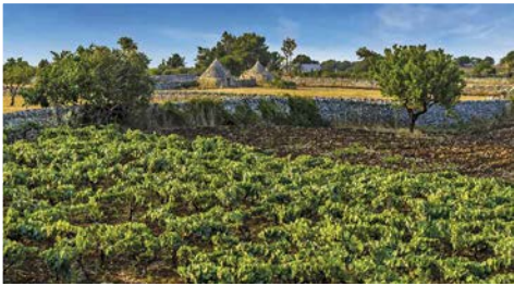
Above: Martina Franca Inset: Vineyards and olive groves near Martina Franca

Discovery: Wonders of Polignano a Mare. This vibrant fishing village rises from craggy limestone cliffs. Witness the medieval Marchesale Arch in the historic center, and weave through cobbled lanes lined with artisans' workshops, restaurants and shops. Gather for a Welcome Reception tonight.