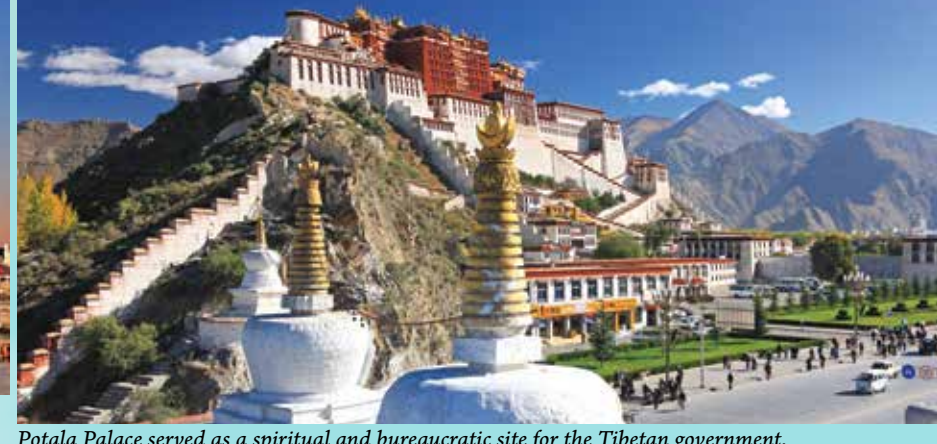
Potala Palace served as a spiritual and bureaucratic site for the Tibetan government.

Farther up the mountain, visit the opulent chapels in the Red Palace, where jewel-laden monuments honor previous Dalai Lamas.