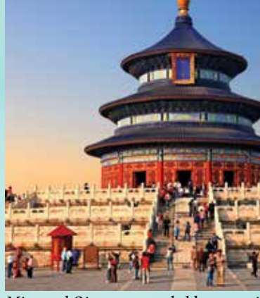
Ming and Qing emperors held ceremonic Temple of Heaven, founded in the early

See Chinese cosmogeny extraordinarily rendered in the Temple of Heaven, a UNESCO World Heritage-designated complex of religious buildings symbolizing the classic relationship between heaven and Earth.