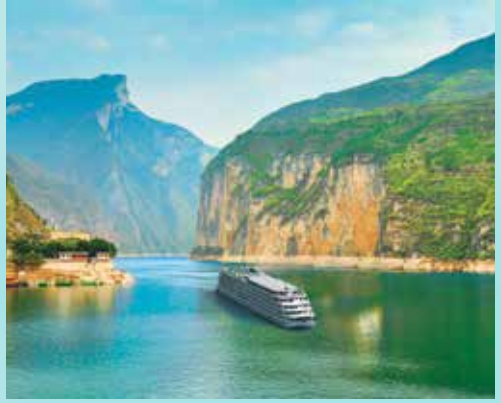
Cruise the Yangtze River through the heart of China, a landscape of verdant mountains and sheer cliffs. centers of Gelugpa, or Yellow Hat—the most widespread order of Tibetan Buddhism—once housed more than 5000 monks. Observe the animated style of debate they practice each

Just outside the city, the 15th-century Sera Monastery, one of the great educational