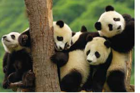
Considered a Chinese national treasure, the vulnerable giant panda is the rarest member of the bear family.