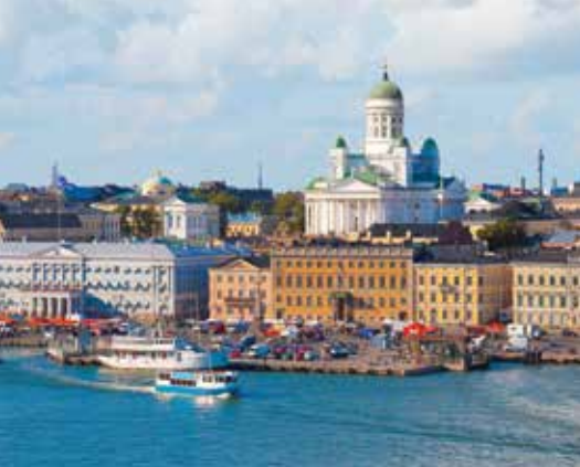
Finland's capital city of Helsinki showcases elegant Jugendstil architecture along its picturesque harbor.

PRSR STD U.S. Postage PAID Gohagan & Company