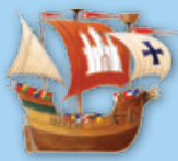
Hanseatic Cog Ship