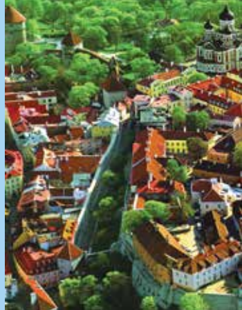
Tallinn, a hub of culture and commerce, is home to a 600-year-old spires and gables that date back to the 13th century.