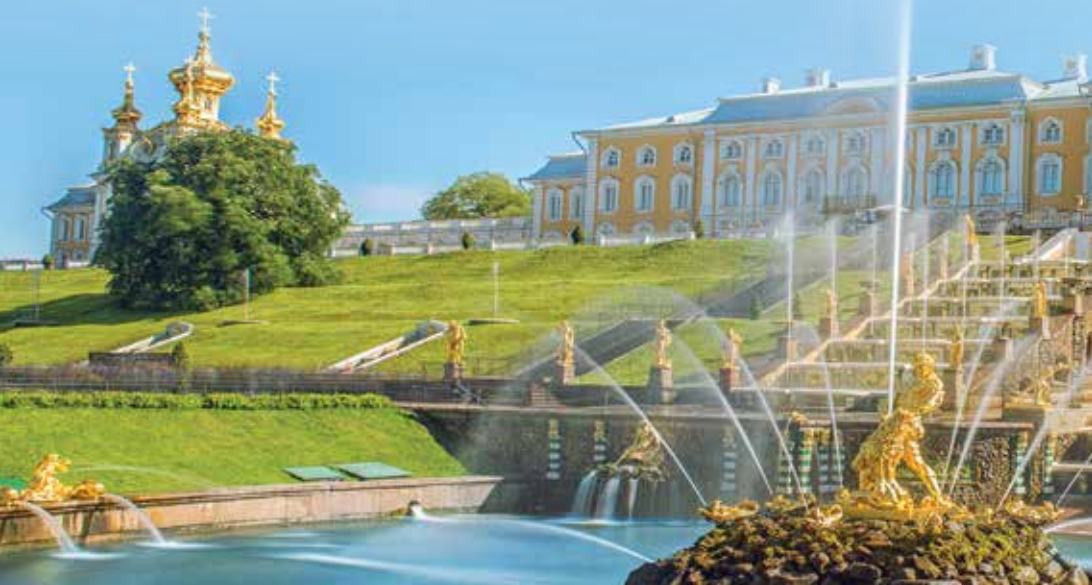
Photo this page: Peter the Great himself partially engineered the resplendent plexus of waterfalls, fountains and statues that adorns the foreground of the opulent Grand Palace at Petrodvorets.

Cover photo: Spanning 14 small islands, where shimmering Lake Mälaren meets one of the largest archipelagos in the Baltic Sea, Stockholm preserves its splendid medieval and Renaissance architecture.