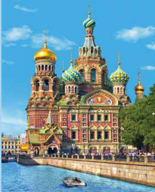
St. Petersburg's Church of the Resurrection of Christ is a showcase of neo-medieval Russian architecture.