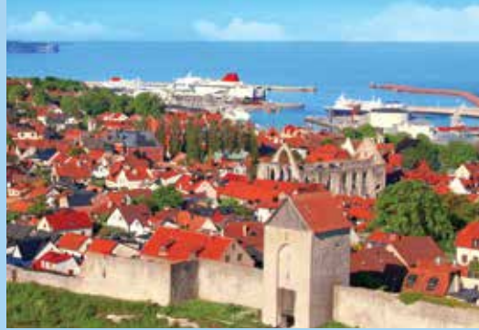
Visby's medieval wall, constructed in the 13 th century, stretches two miles in length around the town.

historic center, where landmarks are scattered across more than 40 islands linked by more than 300 bridges. See exquisite examples of Russian Baroque and neoclassical architecture along the main thoroughfare, Nevsky Prospekt; the ornate Church of the Savior on Spilled Blood (Church of the Resurrection of Christ), built on Emperor Alexander II's assassination site; and the 19 th -century St. Isaac's Cathedral, whose striking golden dome crowns the city's skyline. Visit St. Petersburg's first building, the Peter and Paul Fortress, constructed to secure the country's access to the sea, and the Baroque Cathedral of