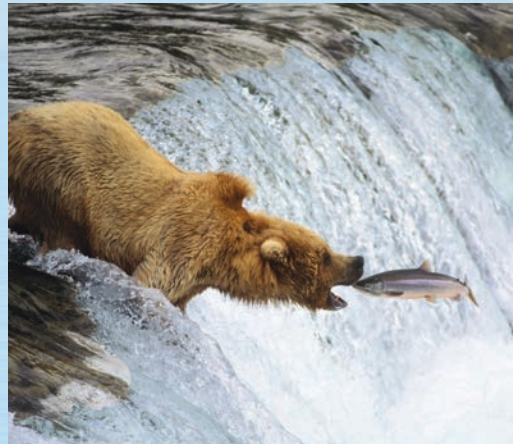
Observe graceful brown bears catching wild salmon.

Cruise into the mouth of LeConte Bay, where the protected waters form a natural refuge for harbor seals from predators. From aboard Zodiacs, watch for mother seals and pups sunning themselves on icebergs.