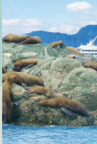
Visit Elfin Cove and look for ringed seals.

nutrient-rich waters of Point Adolphus while cruising through Icy Strait to Inian Island, where unspoiled tidal waters teem with marine life. Aboard Zodiacs, watch for sea lions hunting and bald eagles swooping, drawn by the abundance of salmon. Explore pristine Chichagof Island, where you will go ashore to visit the small fishing community of Elfin Cove. With only 20 permanent residents and situated across from Glacier Bay National Park, this hamlet comes alive in summer, attracting commercial and sport fishing enthusiasts.