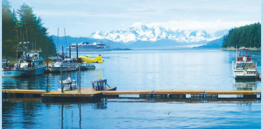
Watch for migrating humpback whales frequenting Elfin Cove, teeming with halibut, salmon and rockfish.