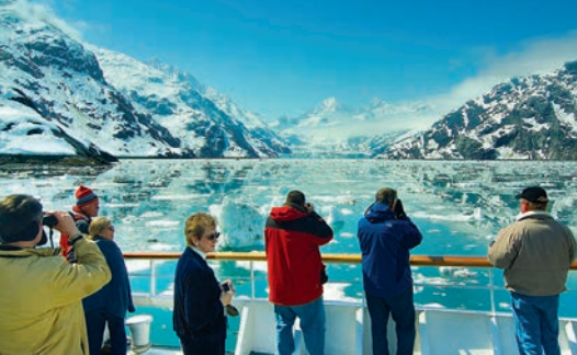
Be on deck while cruising the spectacular Inside Passage.

PRSR STD U.S. Postage PAID Gohagan & Company