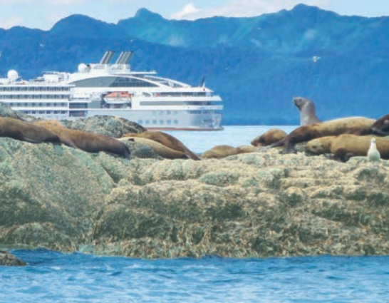
d seals, also known as ice seals, at rest on rocks.

This bay is the terminus of LeConte Glacier, North America's southernmost tidewater glacier that frequently calves icebergs.