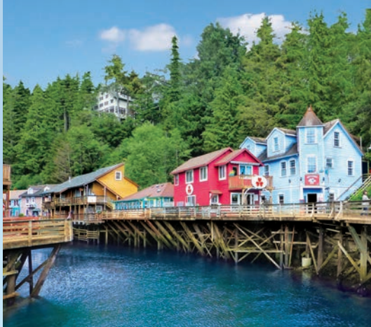
Stroll the gold rush-era boardwalks of Ketchikan's Creek Street and look for salmon swimming upstream.

Aboard our Five-Star ship, experience the fabled Inside Passage, one of the most scenic waterways in the world, cruising amidst countless islands, thickly blanketed forests, hidden bays and coves, sandy beaches and lofty waterfalls flowing from mountain cliffs. Be on deck to watch for cavorting sea lions and breaching orcas in the deep waters and brown bears, Sitka black-tailed deer, mountain goats, beavers, mink, foxes and river otters roaming the shores and mountainsides.