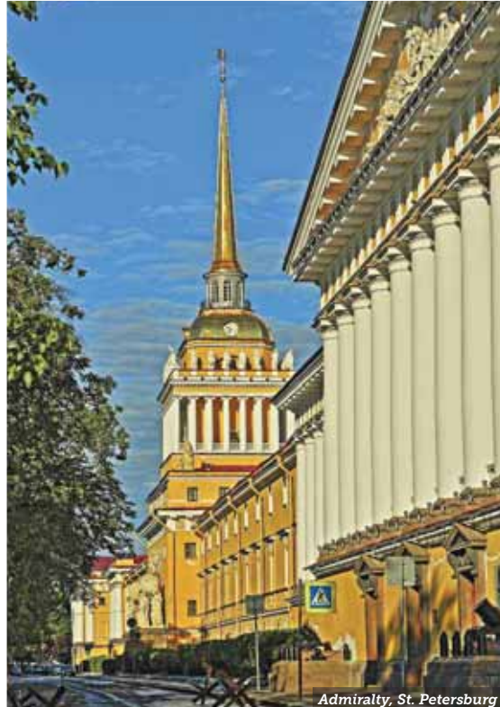
Admiralty, St. Petersburg