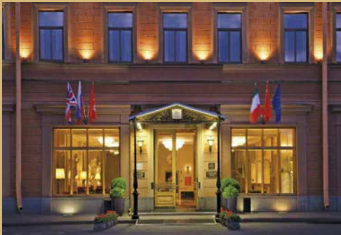
ANGLETERRE HOTEL | ST. PETERSBURG