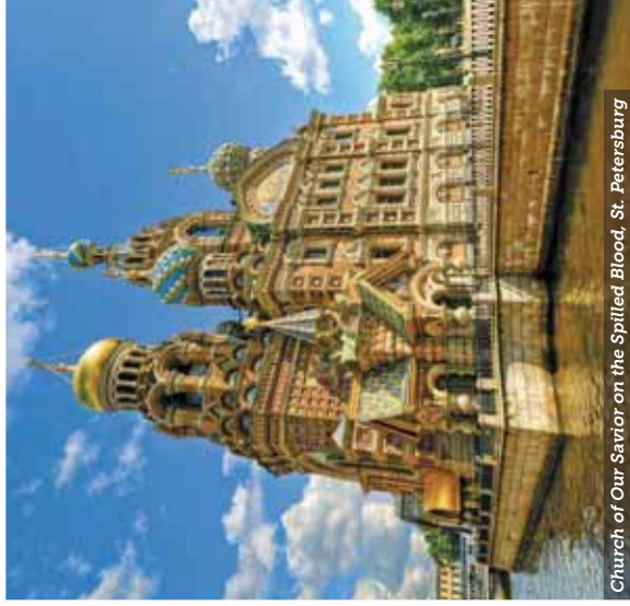
Church of Our Savior on the Spilled Blood, St. Petersburg