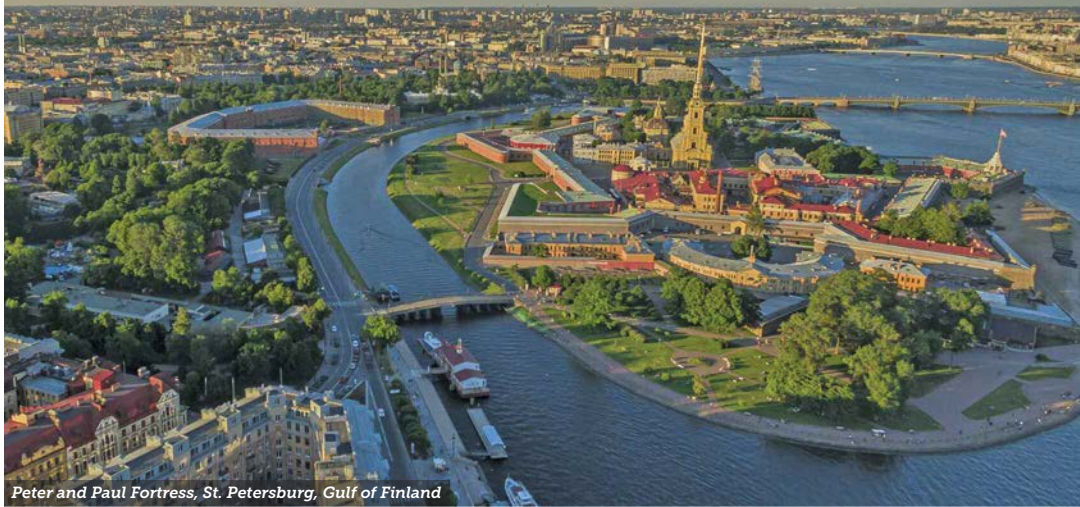
Peter and Paul Fortress, St. Petersburg, Gulf of Finland