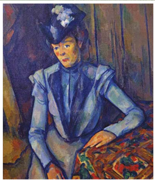
"Lady In Blue," Cezanne, State Hermitage Museum