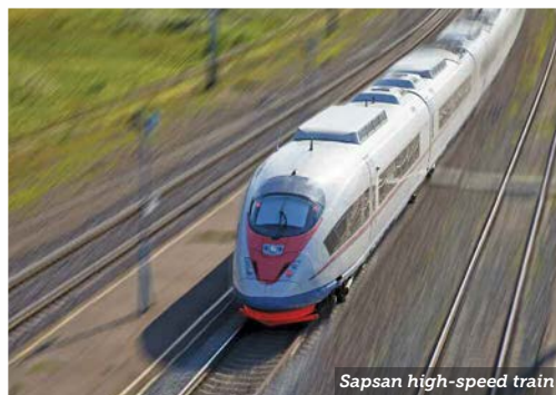
Sapsan high-speed train

Sapsan train ride to St. Petersburg. Named for the peregrine falcon, the Sapsan zips between cities at speeds of up to 155 miles per hour.