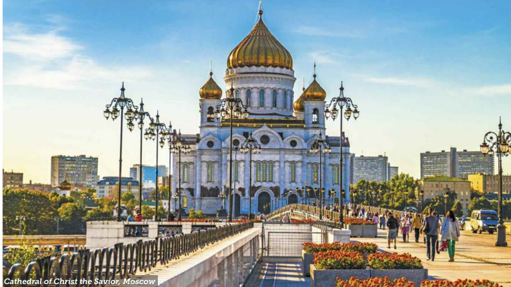
Cathedral of Christ the Savior, Moscow