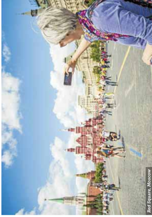
Red Square, Moscow