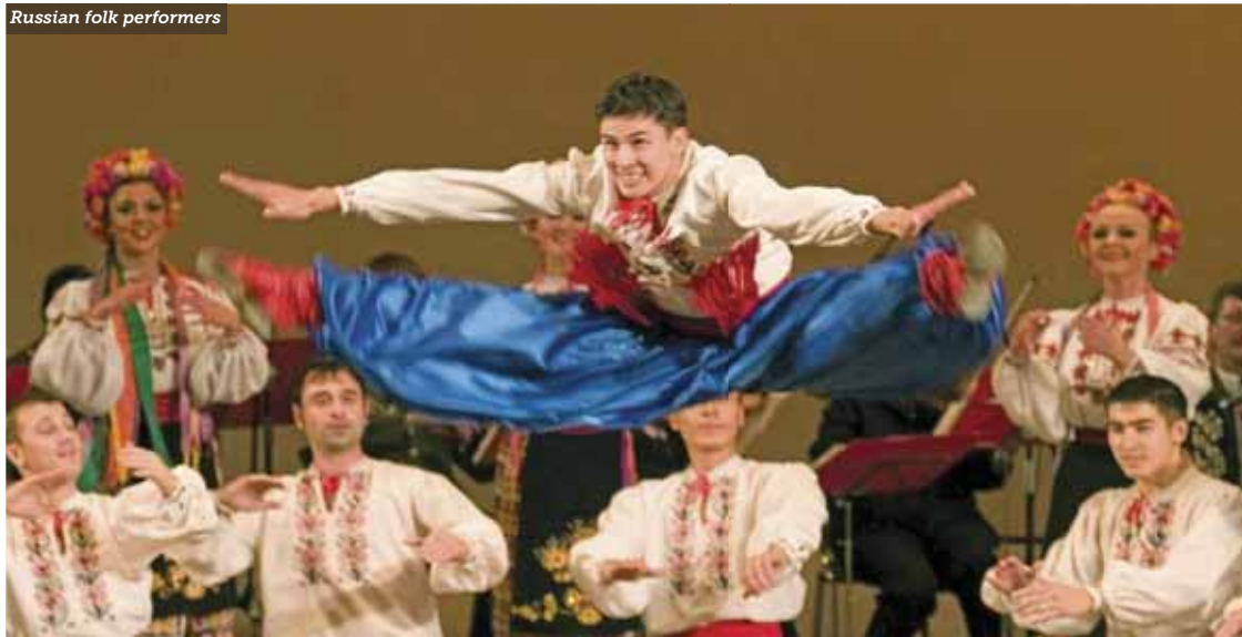
Russian folk performers