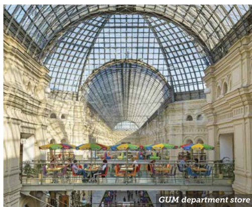
GUM department store

Discovery: Novodevichy Convent and Cemetery. Explore the peaceful oasis of this 16th-century religious complex, designated a UNESCO World Heritage site. Built in the Moscow baroque style, the convent is known for its gorgeous gold- and silver-domed Smolensk Cathedral and the frescoes within. Both convent