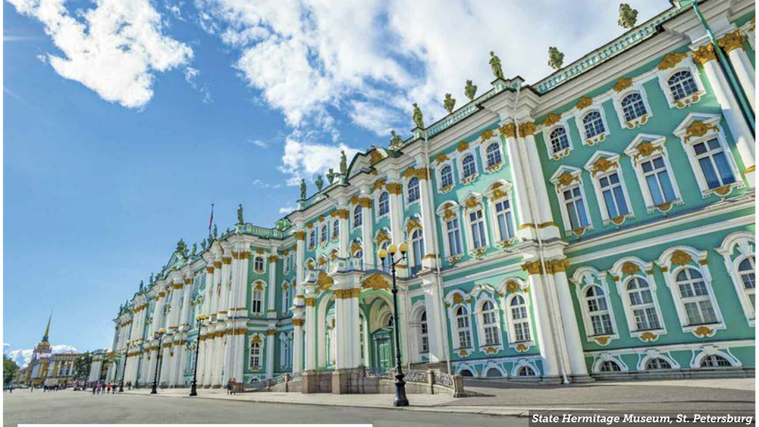
State Hermitage Museum, St. Petersburg