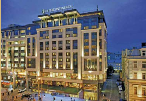
INTERCONTINENTAL MOSCOW - TVERSKAYA | MOSCOW