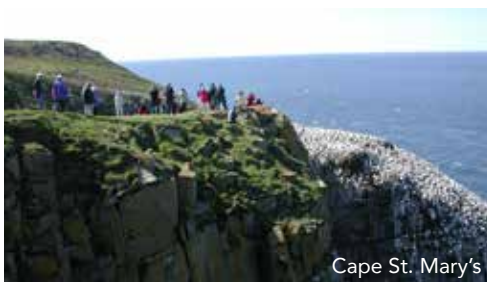
Cape St. Mary's