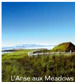
L'Anse aux Meadows