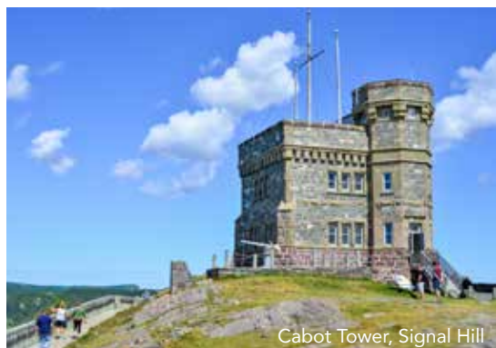
Cabot Tower, Signal Hill

Activity Level: The majority of the program's activities will take place outdoors and a fair amount of walking on varying terrain is to be expected. It is our expectation that guests on this program are able to walk a mile at a moderate pace, get in and out of a motor coach, and walk up a flight of stairs without assistance.