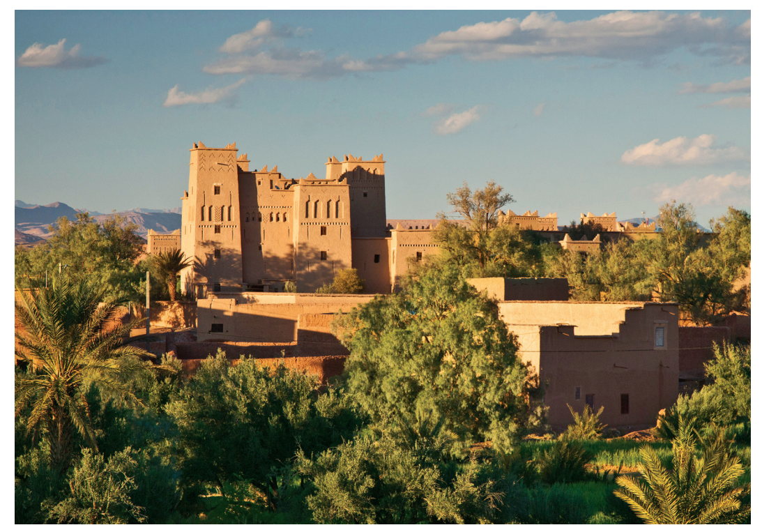
On Days 9 and 10, we travel through the High Atlas.

Day 6: Fez This morning we return to the medina to discover some hidden treasures, including the Blue Gate, the most picturesque of all the Old City's historic gates; the medieval school of Bouanania; and the 12<sup>th</sup>-century home of Jewish scholar Maimonides. We also visit the traditional quarter to watch artisans craft the acclaimed Fez pottery and ceramics. The remainder of the afternoon is free for independent exploration and lunch on our own. B , D