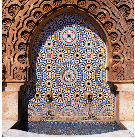
Traditional Moroccan tile work

En route to Marrakech today, we stop first at uninhabited Ait ben-Haddou, a UNESCO World Heritage site and one of southern Morocco's most scenic villages that is often used as a location for fashion and film shoots. Its old section consists of deep red kasbahs packed together so tightly they appear to be a single unit. Then as we begin our descent from the High Atlas, we pass through typical villages with fortified walls and stone houses with earthen roofs. In Tizi N'Tichka, we traverse the Pass of the Pastures (alt.