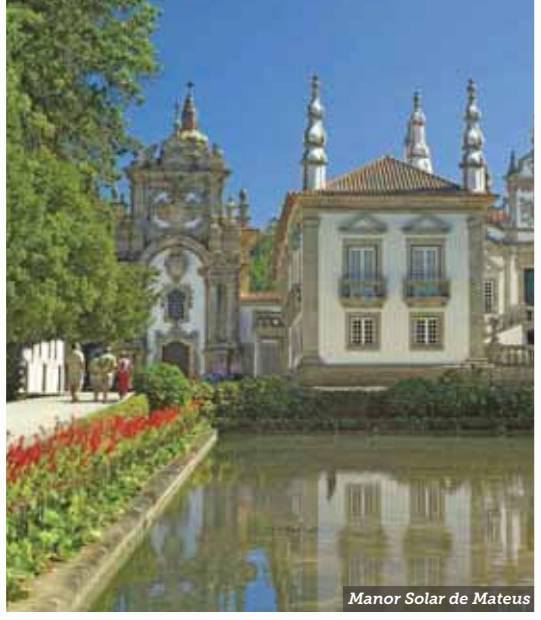
Manor Solar de Mateus