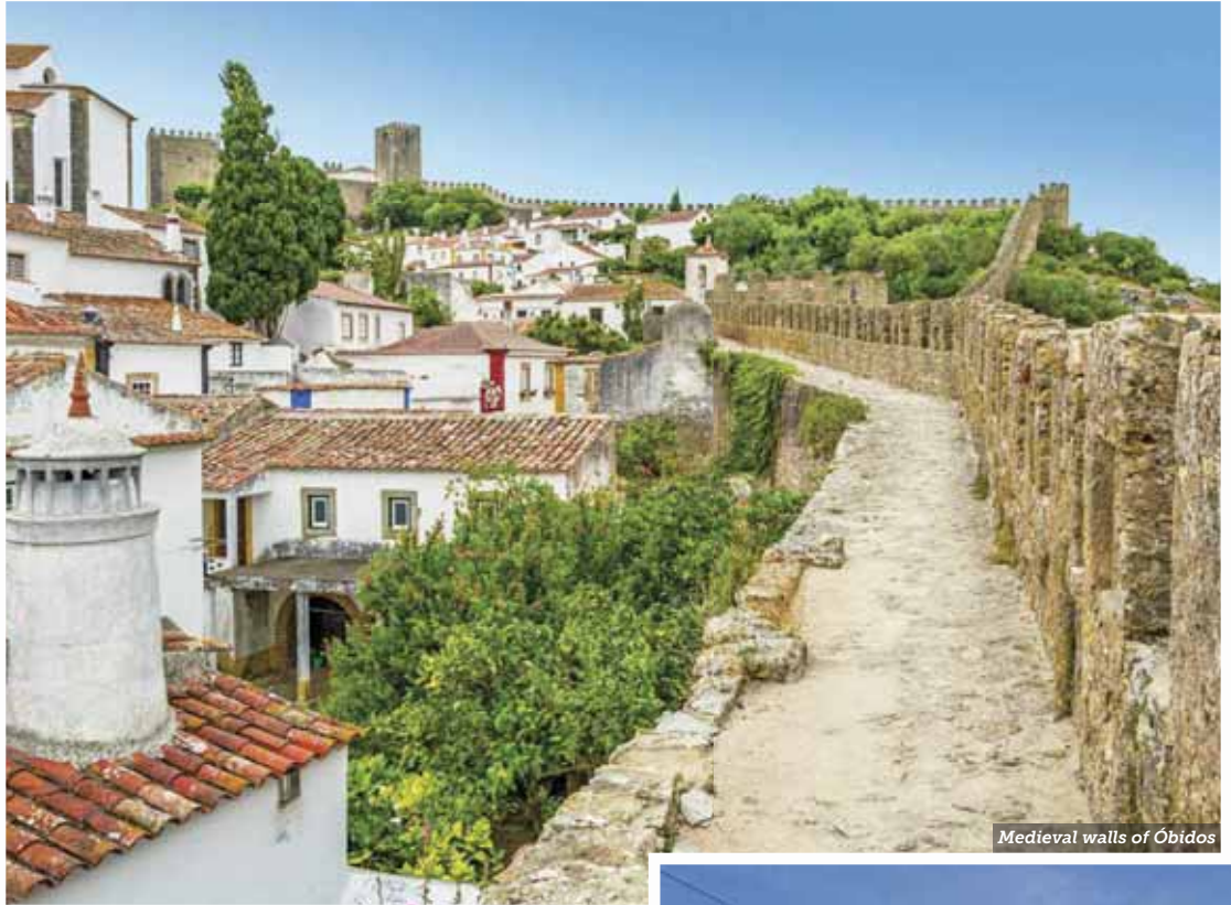
Medieval walls of Óbidos