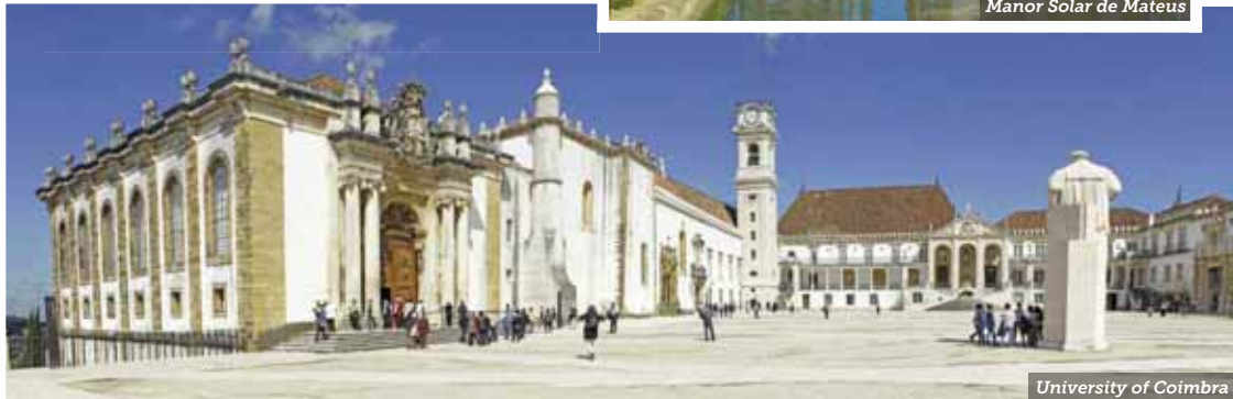
University of Coimbra

commemorates Vasco da Gama's pivotal journey as the first European navigator to sail from Europe to India. The Monument to the Discoveries honors several individuals who played integral roles in Portuguese exploration.