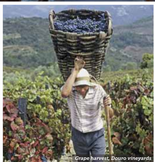
Grape harvest, Douro vineyards