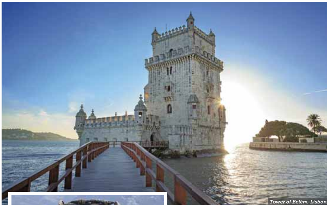
Tower of Belém, Lisbon