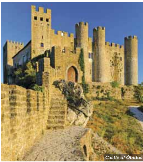
Castle of Óbidos