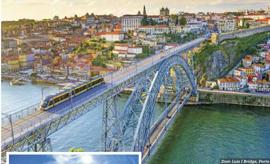
Dom Luís I Bridge, Porto