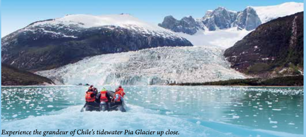
Experience the grandeur of Chile's tidewater Pia Glacier up close.

is fed by the retreating tidewater Marinelli Glacier and shelters an elephant seal colony. Board a Zodiac for a shore landing and walk among the subantarctic Magellanic forest's broadleaf trees. See the dramatic environmental effects of tens of thousands of beavers, descendants of the original 20 that were imported from North America in 1946.