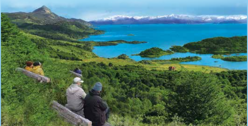
Chile's indigenous Yámana tribe once canoed in cobalt Wulaia Bay and left incredible archaeological traces along the shores of Isla Navarino.

Seasoned expert naturalists, who have studied and traveled extensively in this remote region of the world, will provide lectures and presentations on glaciology in Patagonia, the exploration of Tierra del Fuego, survival of the indigenous people in the region and more aboard the VENTUS AUSTRALIS . The team's collaborative experience and enthusiasm for sharing their knowledge make them exceptionally well-suited to lead your cruise through Patagonia's Chilean fjords.