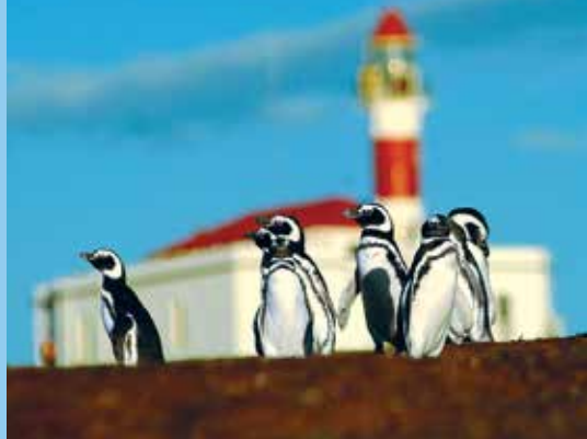
Magdalena Island in the Strait of Magellan is an important Magellanic penguin breeding site.