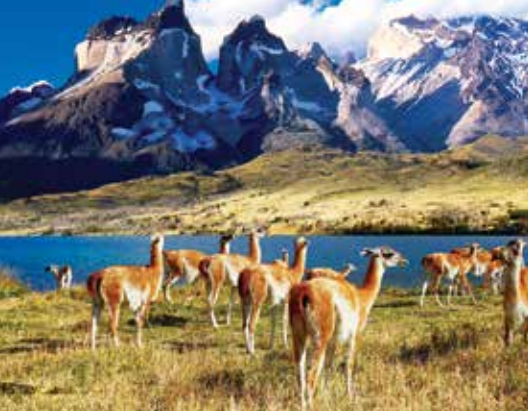
A relative of the domesticated llama, the wild guanaco is native to the Patagonian steppe.

PRSR STD U.S. Postage PAID Gohagan & Company