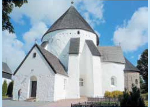
Oesterlars Church is the largest "round church" on Bornholm Island, Denmark.

where legendary landmarks are scattered across more than 100 islands linked by more than three times as many bridges. St. Petersburg's main thoroughfare, Nevsky Prospekt, showcases exquisite examples of Russian Baroque and neoclassical architecture. See the ornate Church of Our Savior on Spilled Blood (Church of the Resurrection of Christ), built on the site of Emperor Alexander II's assassination, and the 19 th -century St. Isaac's Cathedral, with a striking golden dome that is one of the glories of the city's skyline. Visit St. Petersburg's first building, the Peter and Paul Fortress, constructed to secure the country's access to the sea, and the impressive Baroque Cathedral of