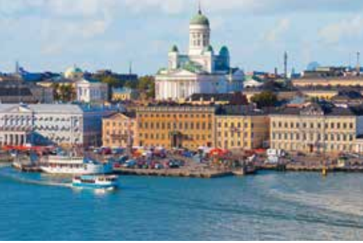
Finland's waterfront capital city of Helsinki showcases elegant Jugendstil architecture along its picturesque harbor.

PRSR STD U.S. Postage PAID Gohagan & Company