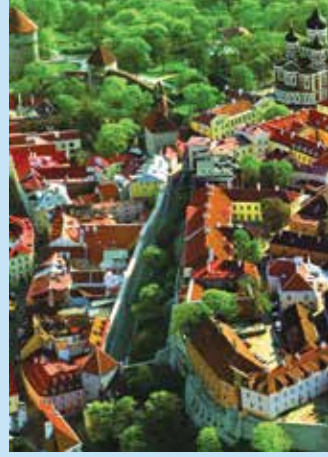
Tallinn, a hub of culture and commerce, is known for its 600-year-old spires and gables.

Catherine the Great. Its spectacular collections are rivaled only by its lavish interior.