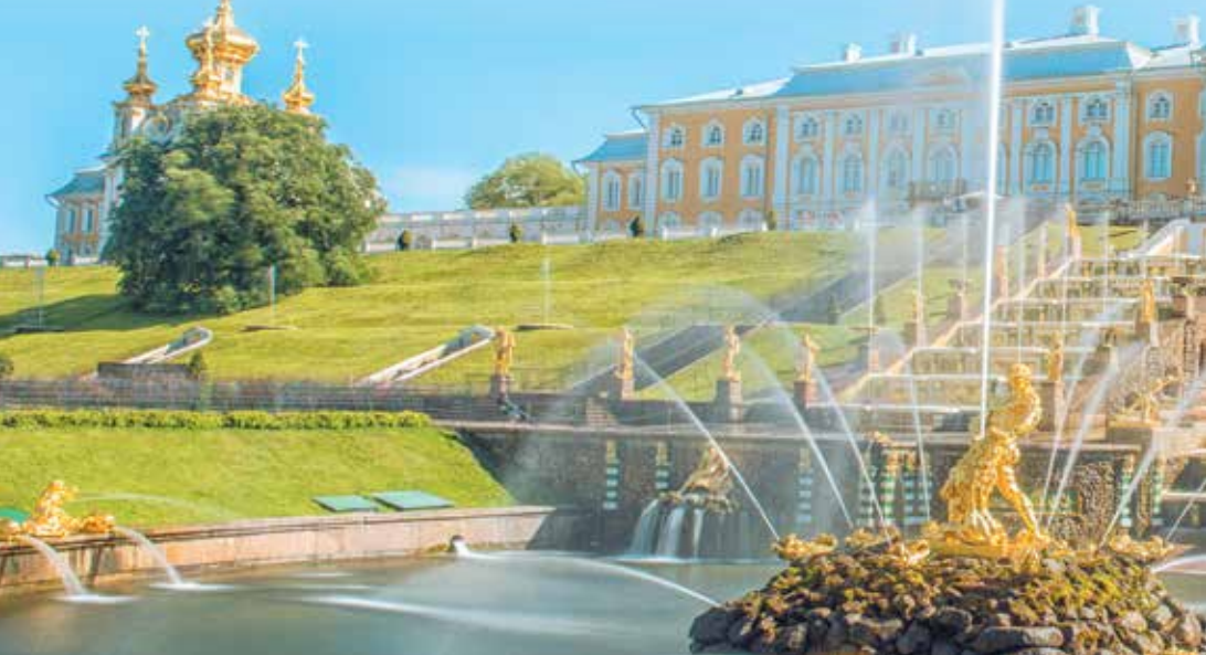
Photo this page: Peter the Great himself partially engineered the resplendent plexus of waterfalls, fountains and statues that adorns the foreground of the opulent Grand Palace at Petrodvorets.

Cover photo: Spanning 14 small islands, where shimmering Lake Mälaren meets one of the largest archipelagos in the Baltic Sea, Stockholm balances medieval and Renaissance architecture with modern urban design.