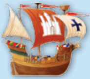
Hanseatic Cog Ship