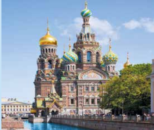
St. Petersburg's Church of the Resurrection of Christ is a showcase of neo-medieval Russian architecture.