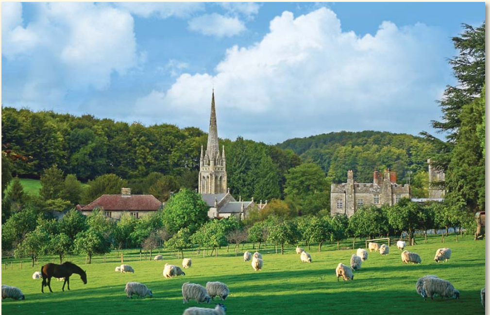
The long twilight glow of a perfect English summer evening sweeps over Chipping Campden, a serene, quintessential Cotswold village with a deep-rooted history in the wool trade.