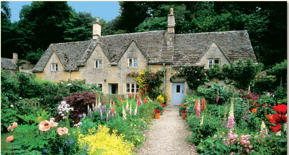
Romantic gardens and classic stone houses are just two English traditions that live on in the Cotswolds, a bastion of beauty, history and culture.

Stow-on-the-Wold is a delightful market town along the ancient Roman Fosse Way, the first great Roman road in Britain. This picturesque market town was designed around the market square during the height of the English wool industry with narrow-walled avenues, called tunes, to funnel up to 20,000 sheep to the market.