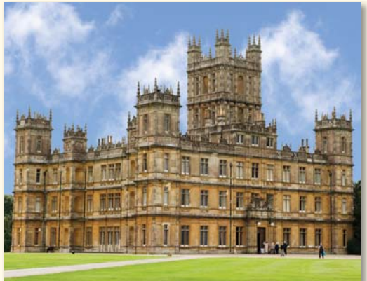
Highclere Castle, a spectacular Victorian family home, is the filming site for PBS MASTERPIECE’s Downton Abbey .