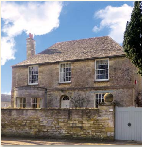
PBS's MASTERPIECE series Downton Abbey portrays Church Gate House as the home of Lady Crawley.

Chipping Campden is a prosperous medieval village with a picturesque 15 th -century Gothic parish church, 17 th -century almshouses and market hall, and wool-tycoon manors.