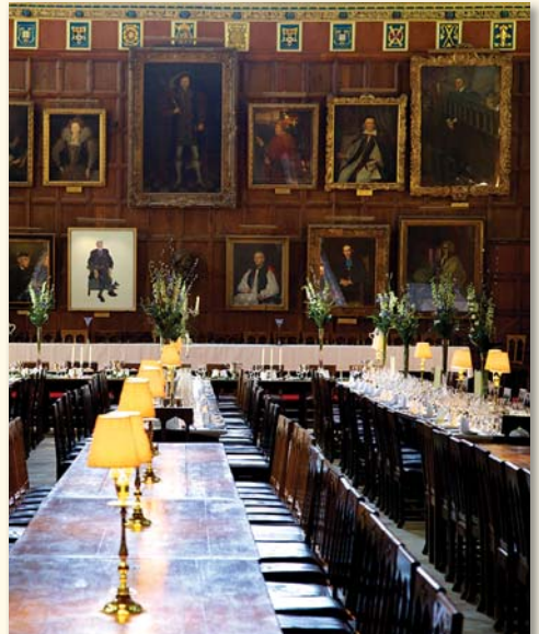
The soaring Great Hall in Christ Church College is one of the oldest and most beautiful dining halls at Oxford.

Affectionately named the “city of dreaming spires,” by adoring poets, Britain's oldest university counts Percy Bysshe Shelley, Margaret Thatcher, and Sir Thomas More among its illustrious alumni. Steeped in eight centuries of history and erudition, Oxford still nurtures great scholars while blending its ancient traditions with cutting-edge research and instruction provided by many of the world's brightest minds. Here, Formal Hall, a dining hall tradition requiring formal attire or college gowns, is still celebrated with a three-course meal and waiter service. Magnificent cobblestoned squares, medieval alleyways and Renaissance quadrangles fill the grounds of the oldest university in the English-speaking world.