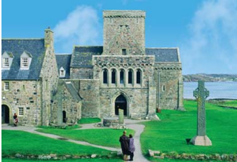
Tour Iona Abbey, Scotland's holiest place since the sixth century A.D. and traditionally believed to be where the Book of Kells was created.

RESPONSIBILITY: Thomas P. Gohagan & Company, the sponsoring associations/organizations, and its and their employees, shareholders, subsidiaries, affiliates, officers, directors or trustees, successors, and assigns (collectively "Gohagan"), do not own or operate any entity which is to or does provide goods or services for your trip including, for example, lodging facilities, airline, vessel, or other transportation companies, guides or guide services, local ground operators, providers or organizers of optional excursions, food service or entertainment providers, etc. All such persons and entities are independent contractors. As a result, Gohagan is not liable for any negligent or willful act or failure to act of any such person or entity or of any other third party.