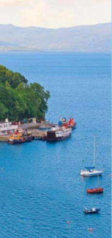
Engaged in the colorful erlook the Sound of Mull.