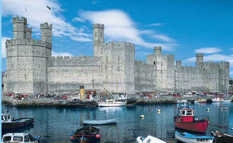
Explore Edward I's impressive Caernarfon Castle, the mightiest link in his Iron Ring of 13 th -century fortresses across North Wales.

whose leadership reshaped the world. He provides fascinating insight on the worldwide ramifications of Operation Overlord, the Allies' code name for the World War II military campaign that launched the D-Day airborne and amphibious invasion on Normandy. Tonight, cruise across the English Channel.