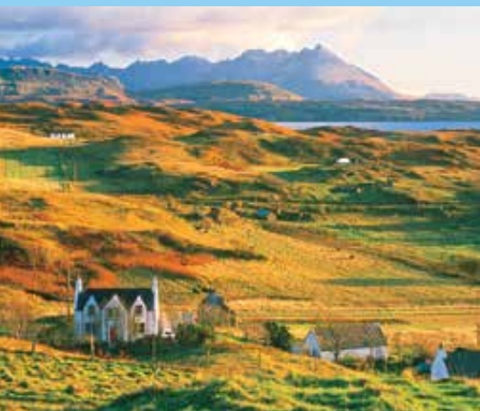
Skye's rolling moors have captivated generations of visitors to Scotland's Inner Hebrides.

Visit beautiful Bodnant Garden, one of the finest examples of 19 th -century Victorian landscape artistry. Enjoy lunch in a local restaurant and listen to a stirring private choir performance of Welsh hymns.