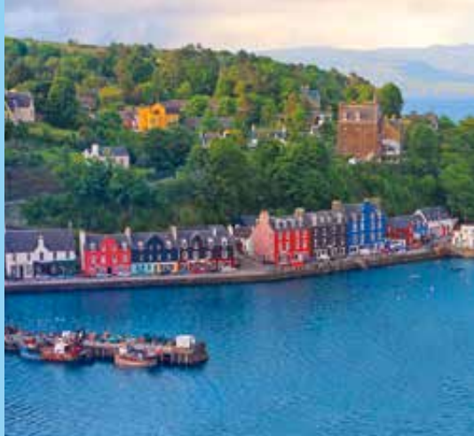
The traditional way of life in the Scottish Isles remains unchanged in Tobermory, where brightly painted houses line the fishing port of Tobermory, where brightly painted houses line the harbor.

Albert Memorial Clock in Queen's Square; the Scottish baronial Belfast Castle; and Stormont, the Edwardian Parliament Buildings that are home to the Northern Ireland Assembly.