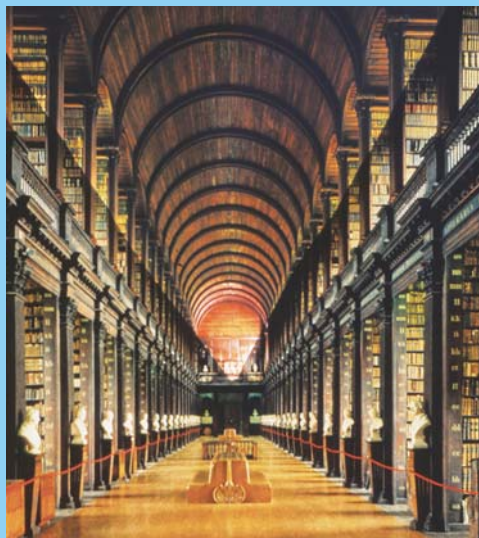
The Long Room of Trinity College's Old Library showcases 200,000 of the library's oldest books, with the Book of Kells on display in the adjacent Treasury.

whose leadership reshaped the world. He provides fascinating insight on the worldwide ramifications of Operation Overlord, the Allies' code name for the World War II military campaign that launched the D-Day airborne and amphibious invasion on Normandy. Tonight, cruise across the English Channel.