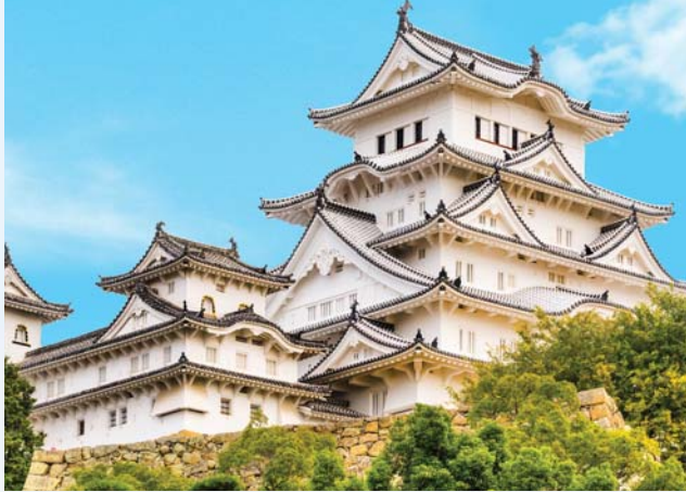
The UNESCO-designated Himeji Castle is referred to as Shirasagi-jo, meaning "white egret castle," for its resemblance to a bird taking flight.

windows as "living Japanese paintings," are widely considered to be the best in the country.