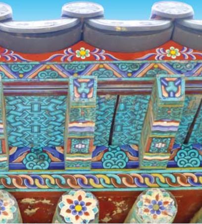
Important example of Silla architecture and is home to the Seokgatap and Dabotap stone pagodas.