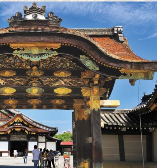
Decorated karamon gate to enter Nijō Castle, one of 17 historic sites designated by UNESCO as a World Heritage site.

After lunch, visit the Royal Burial Mounds at Tumuli Park where, in 1974, the 43-foot-high Cheonmachong (Heavenly Horse) Tomb, dating from the fifth century, was excavated, revealing over 10,000 royal treasures inside.