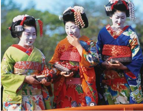
Maiko, apprentice geiko, are recognized by their kanzashi (hair ornaments) and colorful kimonos.