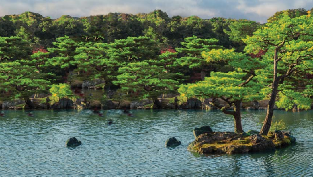
Photo this page: Kyoto’s UNESCO-designated Golden Pavilion functions as a shāriden, housing relics of the Buddha.

Cover photo: Miyajima’s Great Torii Gate is thought to be the boundary between the spirit and the human worlds.