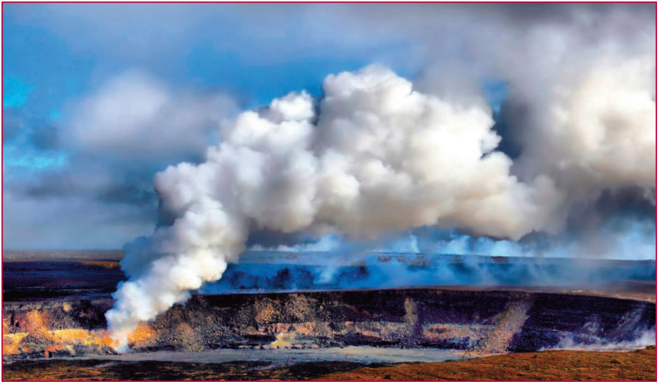
Halema'uma'u Vent, Volcanoes National Park

picnic lunch of local specialties and tropical fruit. Watch the sunset near the crater and marvel at the lava's glow. Then Settle in for a dinner overlooking the crater. (B,L,D)