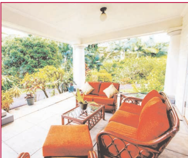
The Lanai (front porch)