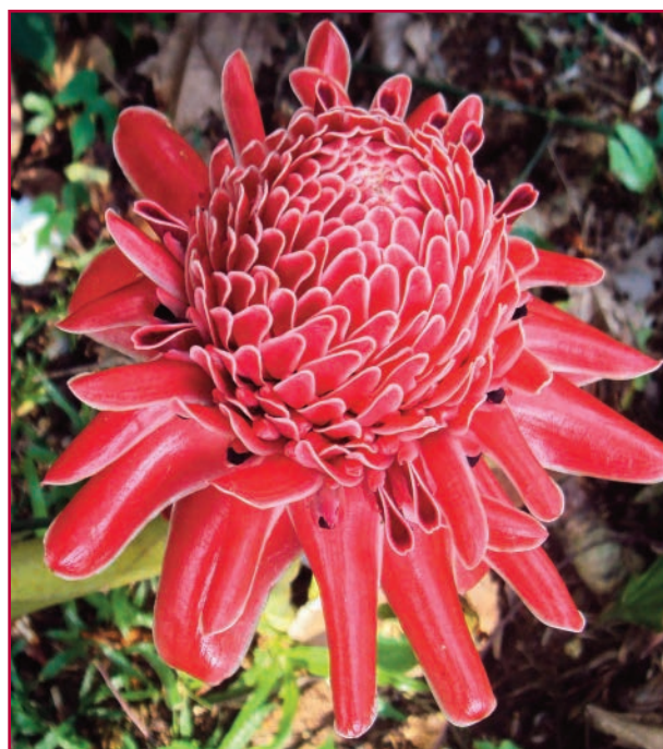
Torch Ginger, Hawaiian Tropical Botanical Gardens