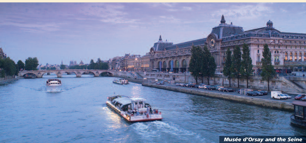
Musée d'Orsay and the Seine

Stay in the heart of the city at the Citadines Les Halles Paris, located within the Forum des Halles, a large shopping and entertainment complex. With shops and restaurants just steps away plus the Louvre Museum, Pompidou Centre, Pont Neuf, theaters and more within walking distance, this hotel puts Paris at your doorstep. A Métro station is across the street for those times when you want to explore further afield. The well-equipped studios and one-bedroom apartments feature satellite TV and a kitchenette to make this your own Parisian pied-à-terre. This apartment-style hotel also has Wi-Fi.