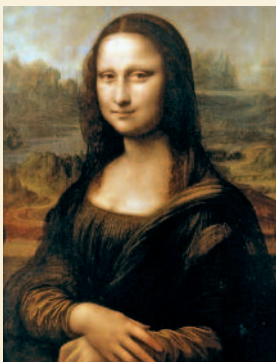
Above: Inside the Louvre Right: "Mona Lisa," Louvre

arguably the world's greatest art collection. Learn about the museum and the best way for you to approach it during this valuable lecture.