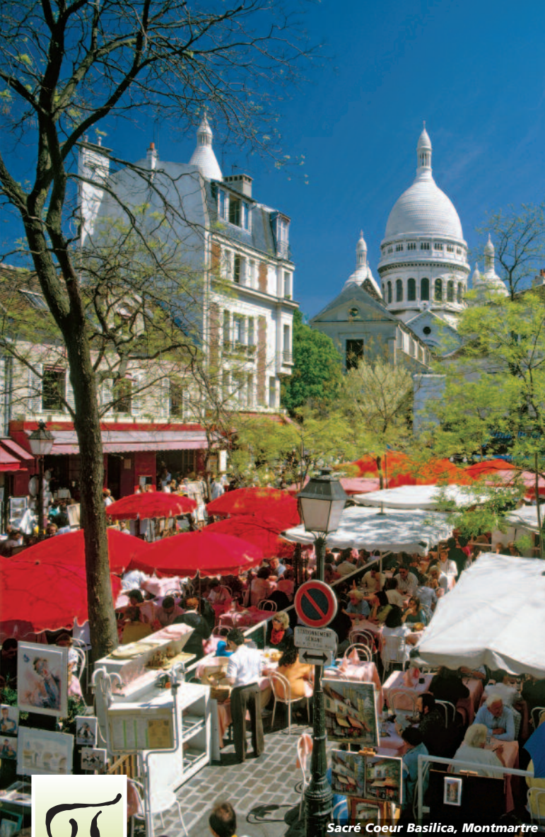
Sacré-Coeur Basilica, Montmartre