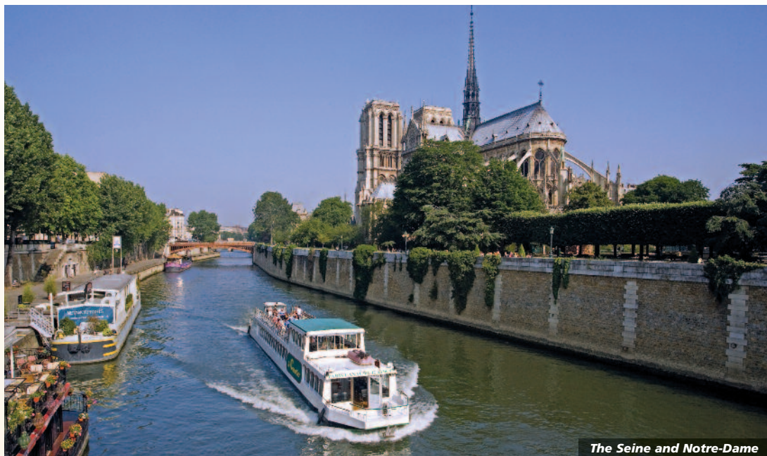
The Seine and Notre-Dame

Paris is perhaps the most magnificent city in the world. The iconic architecture, artistic treasures, unparalleled cuisine and century upon century of history can leave a rushed traveler breathless. But take the time to stroll its intimate quarters, chat with neighborhood shopkeepers and unwind in tranquil gardens and churchyards, and you'll come to know Paris' soul. Spend 10 nights in Paris and the memories will stay with you forever.