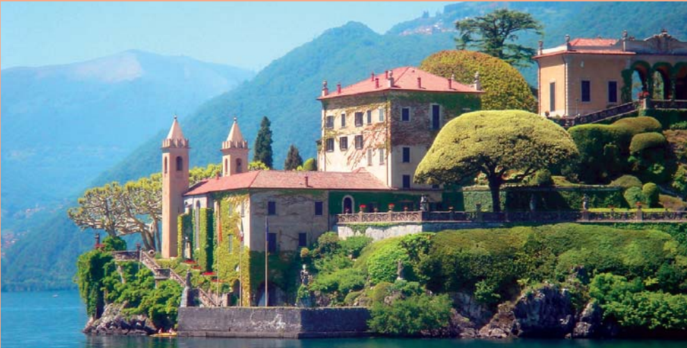
Nestled on the shores of Lake Como and surrounded by majestic Alpine peaks, the legendary Villa del Balbianello has one of the most beautiful and dramatic settings in all of Italy.