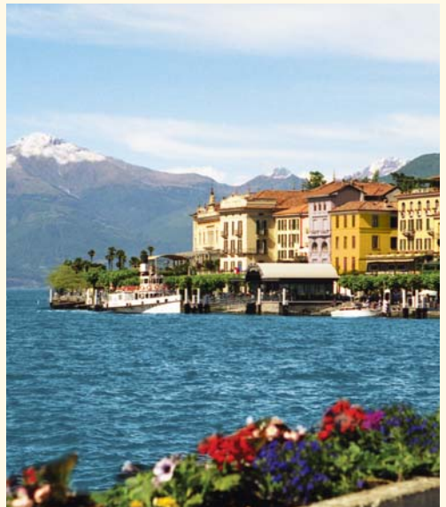
Visit picturesque Bellagio, a splendid combination of fin-de-siècle architecture and stunning panoramic views of Lake Como and the majestic Alps.

An 18 th - and 19 th -century “Grand Tour” of Europe was considered incomplete without a visit to Stresa to experience its spectacular mountain views, tropical gardens and the resplendent glistening waters of Lake Maggiore.