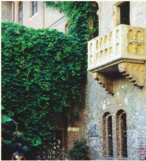
Verona's legendary Casa di Giulietta balcony was inspired by Shakespeare's famous tragic play, Romeo & Juliet.