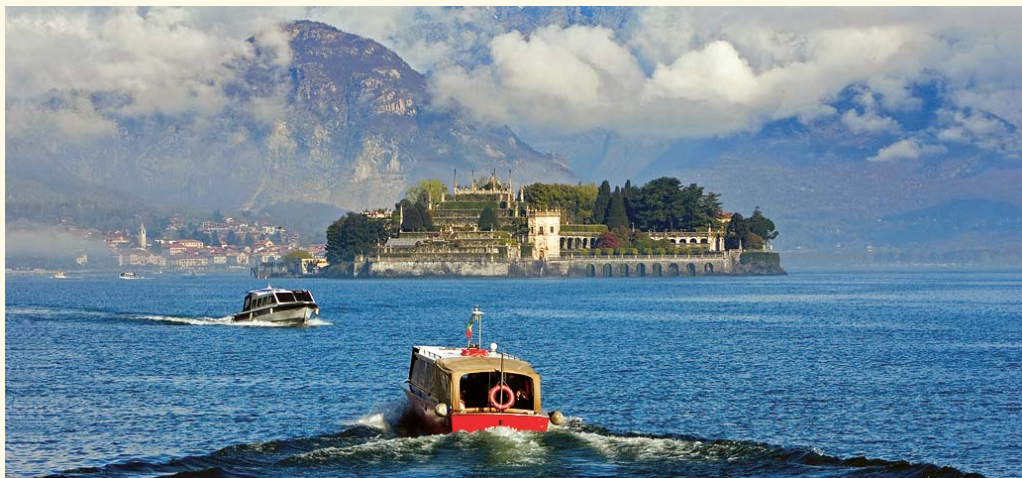
Isola Bella, located in Italy’s renowned wine-producing Piedmont region, is the most spectacular of the Borromean Islands dotting Lake Maggiore. Visit its magnificent 16 th -century villa and stroll through one of the world’s most beautiful gardens.

Founded by the Romans in 196 B.C., Como has been internationally known for its silk-weaving industry since silkworms were first imported here in the 14 th century and is still today the largest European silk producer—dyeing, weaving and designing fabrics shipped to the fashion houses of Milan, Paris and London. Walk along winding cobblestone passages past medieval towers and walls, Renaissance palaces and churches, neoclassical 19 th -century villas and small family-owned negozi (shops) leading to the Piazza Cavour and the tranquil lakeside promenade. During time on your own, peruse the fresh fruit and vegetables in the three-times-weekly outdoor market, a local tradition for centuries.