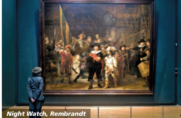
Night Watch, Rembrandt