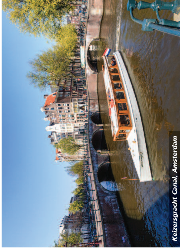
Keizersgracht Canal, Amsterdam