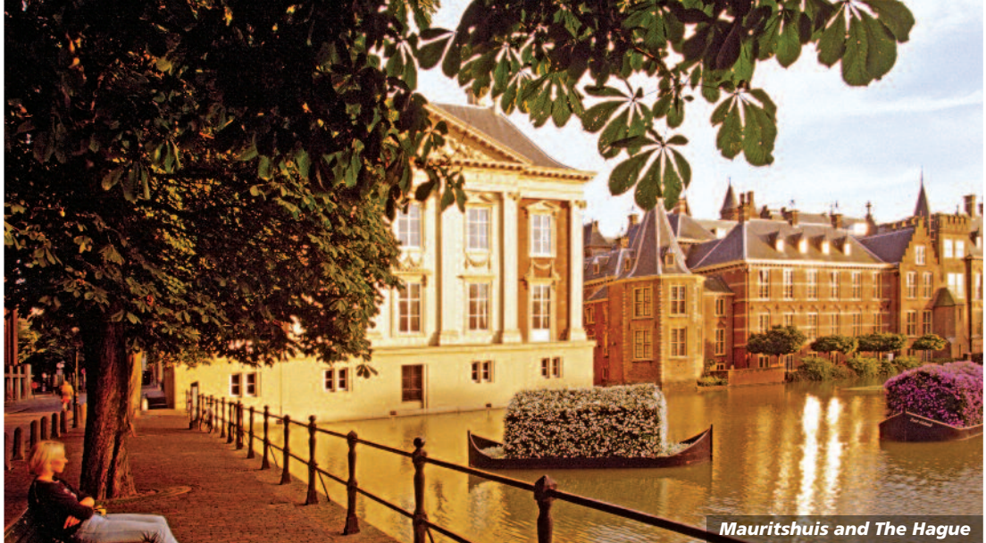
Mauritshuis and The Hague