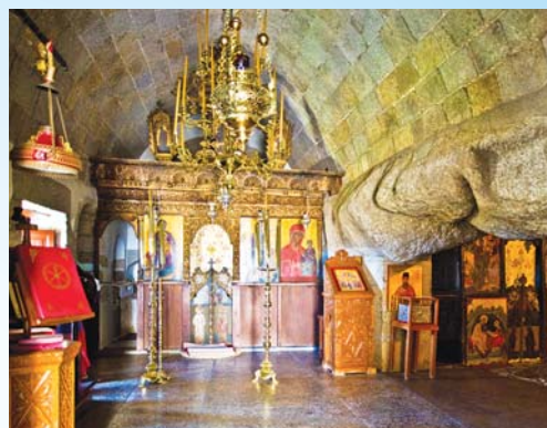
On Pátmos, St. John the Apostle is believed to have written the Book of Revelation in the Cave of the Apocalypse.

See the magnificent Terrace of the Lions, where legendary statues carved from Naxian marble have guarded the island for nearly 2600 years.