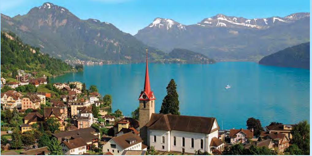
Cruise beautiful Lake Lucerne and enjoy picturesque views of its fjord-like landscape, Mounts Pilatus and Rigi in the distance and its four surrounding cantons of Lucerne, Schwyz, Unterwalden and Uri.

the famous Alte Brücke (Old Bridge) that span the Neckar River. Visit imposing Heidelberg Castle, a magnificent, 13 th -century edifice perched above the river. The stately ruins preserve Heidelberg's links to its medieval past.