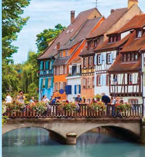
Half-timbered houses in Strasbourg's Petite-France quarter reflect the city's dual French and German character.

traveling from the snow-crowned heights of the Alps to subtropical lowlands. Admire the impressive natural treasures of soaring, snowcapped mountain peaks, green, rolling hills, crystal-clear glacial lakes and densely wooded forests.