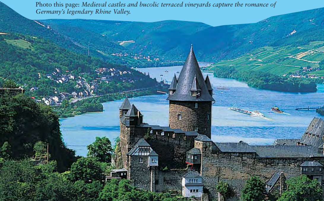
Photo this page: Medieval castles and bucolic terraced vineyards capture the romance of Germany's legendary Rhine Valley.

Cover photo: View the unforgettable peaks of the iconic Matterhorn from the top of the highest cog railway in Europe, the world-renowned Gornergrat Bahn.