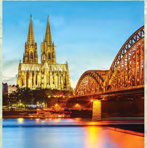
Towering spires crown Cologne's majestic Kölner Dom (cathedral), one of the finest Gothic structures ever built.

Following breakfast, disembark the ship and continue on the Amsterdam Post-Program or depart for the U.S.