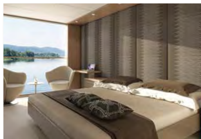
Cabin Category 2

The English-speaking, international crew provides warm hospitality. The M.S. AMADEUS SILVER III meets the highest safety standards and is part of the AMADEUS RIVER FLEET, the only European river fleet to have been awarded the "Green Certificate" of environmental preservation.