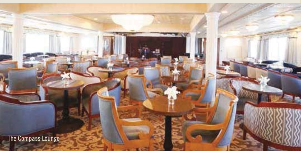
The Compass Lounge

Haimark Line, Ltd. may modify the cruise itinerary up to and during the voyage. All cruise accommodations and shore excursions are arranged by Haimark Line, Ltd., which may use other suppliers or providers to render services. The agreement in this brochure is the exclusive and entire statement of the agreement between you and Go Next, Inc. It should be read carefully.