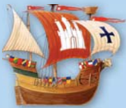
Hanseatic Cog Ship