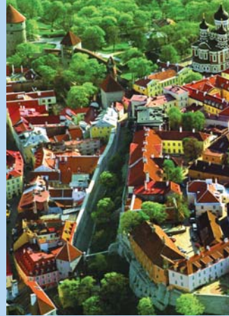
Tallinn, a hub of culture and commerce, showcases the 600-year-old spires and gables of its old town.