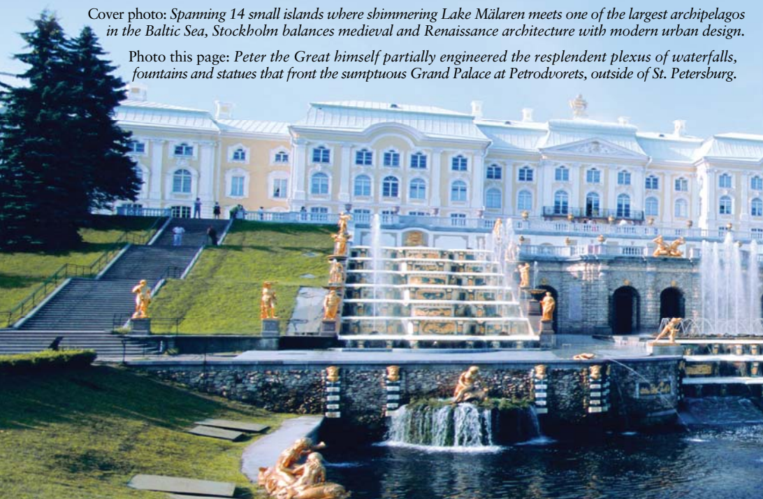
Photo this page: Peter the Great himself partially engineered the resplendent plexus of waterfalls, fountains and statues that front the sumptuous Grand Palace at Petrodvorets, outside of St. Petersburg.

Cover photo: Spanning 14 small islands where shimmering Lake Mälaren meets one of the largest archipelagos in the Baltic Sea, Stockholm balances medieval and Renaissance architecture with modern urban design.