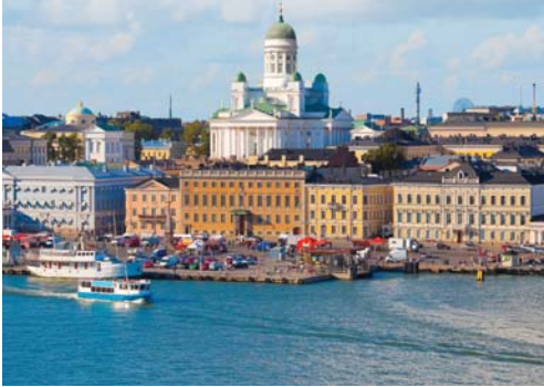
Finland's waterfront capital city of Helsinki showcases elegant Jugendstil architecture along its picturesque harbor.