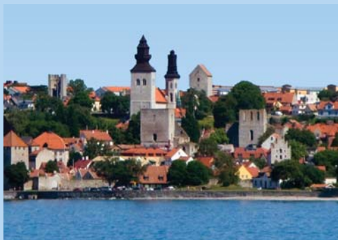
Visby flaunts well-preserved warehouses and houses built by wealthy merchants during centuries of prosperous trade.

In 1980, workers led by Lech Wałęsa founded the Solidarity movement, the first independent trade union in Eastern Europe and the key factor in winning the Polish struggle against Communism. Visit the historic Lenin Shipyard, where the movement began, and its Monument to the Fallen Shipyard Workers. Enjoy time to explore Gdańsk’s lovely Old Town at your own pace.