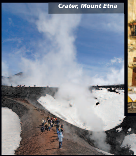
Crater, Mount Etna