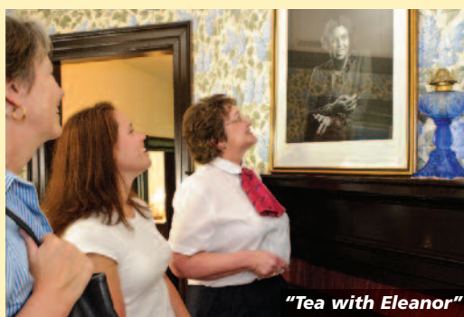
"Tea with Eleanor"

Educational Focus: FDR's Summer Retreat. Delve into the history of Campobello Island. Stroll through the gardens and grounds of Roosevelt Campobello International Park, which is owned and operated by both the United States and Canada. The park is centered around Franklin D. Roosevelt's 34-room "cottage." The home, typical of the turn-of-the-century cottages built by the wealthy summer residents, is filled with original memorabilia.