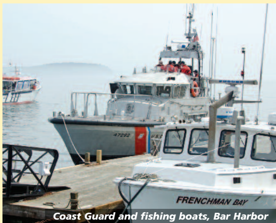
Coast Guard and fishing boats, Bar Harbor

The first settlers arrived here in 1763, and the town gained notoriety as a playground of the rich and famous during the mid-1800s when several of the United States’ most powerful families — the Astors, Rockefellers,