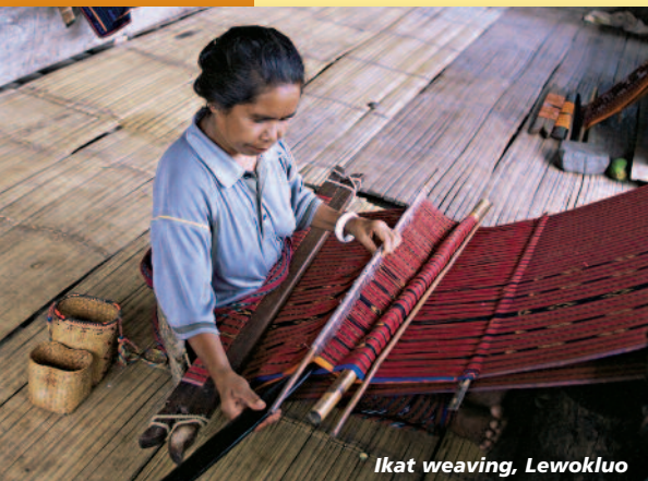
Ikat weaving, Lewokluo