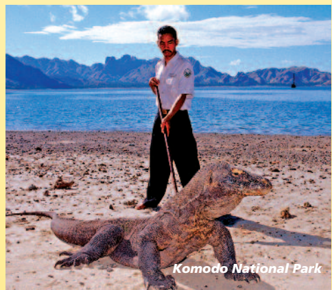
Komodo National Park

Excursion: The Komodo Dragon . Ringed by a coral reef, the tiny island of Komodo is best known as the home of the world's largest lizard, the Komodo dragon, which can weigh more than 150 pounds (68 kilograms). Rangers will guide you through Komodo