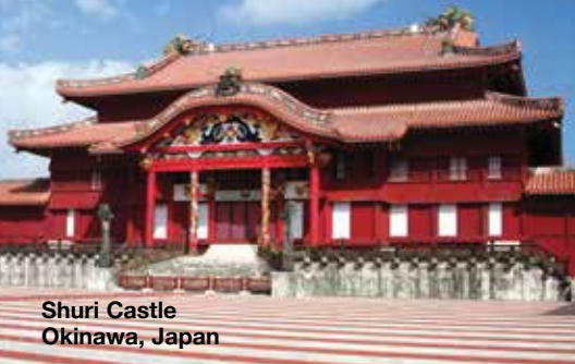
Shuri Castle Okinawa, Japan

This map represents approximate locations.