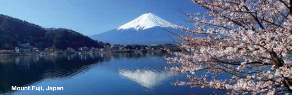
Mount Fuji, Japan