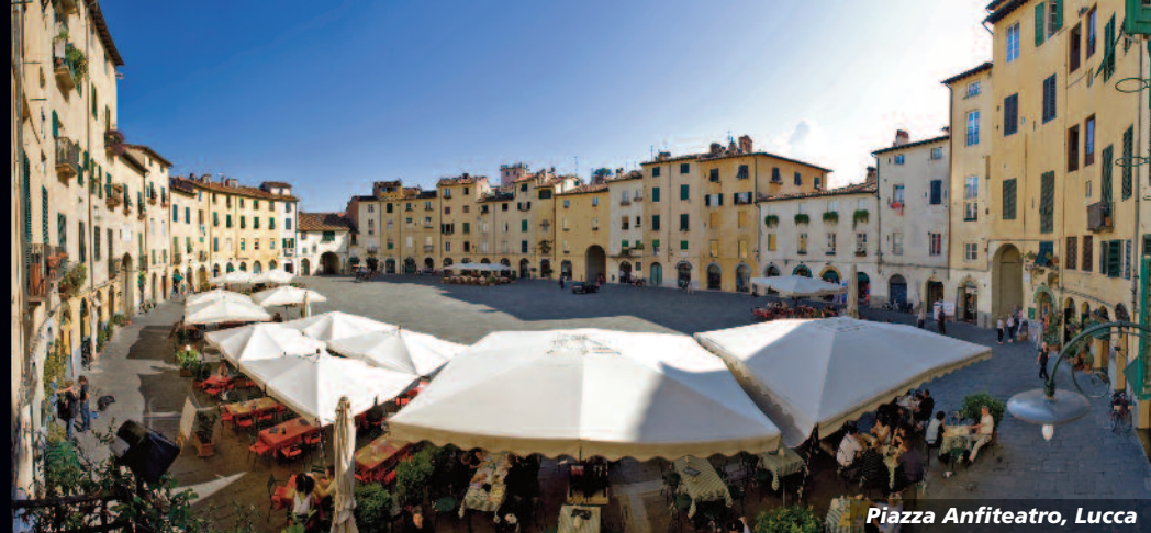
Piazza Anfiteatro, Lucca