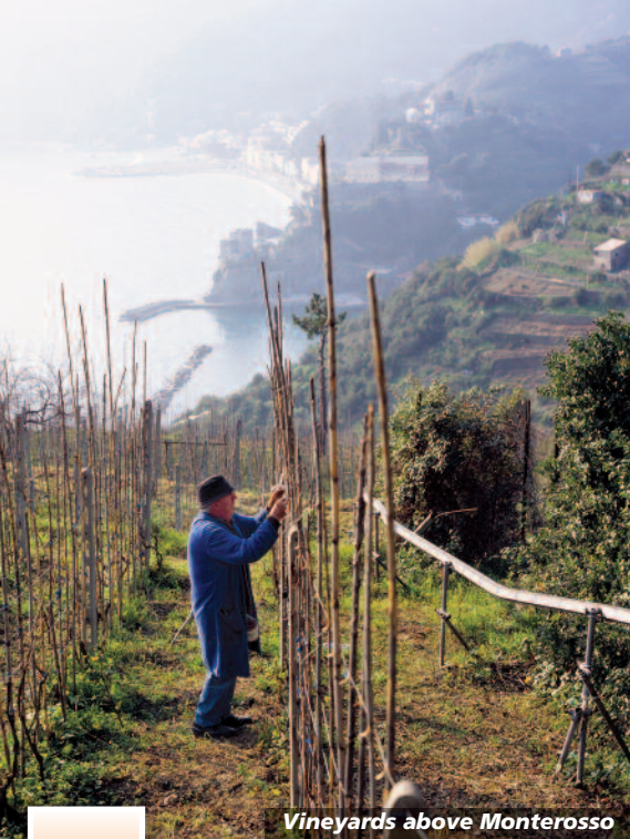
Vineyards above Monterosso