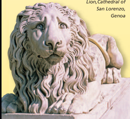
Lion, Cathedral of San Lorenzo, Genoa

This evening, join your fellow travelers for a Welcome Reception and Dinner at the hotel.