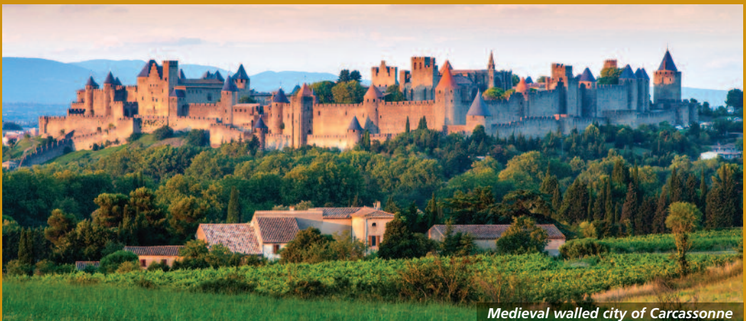
Medieval walled city of Carcassonne