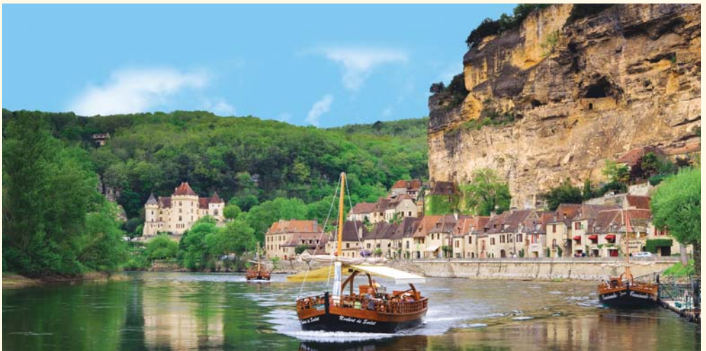
Sail the bucolic Dordogne River aboard a traditional 19 th -century wooden gabare, the typical mode of transportation of the Périgord region for more than 150 years.