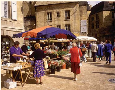
Experience Sarlat-la-Canéda's twice-weekly market, a medieval tradition in the heart of the village.

CULTURAL ENRICHMENT: Enjoy a traditional 19 th -century French folk music and dance performance.