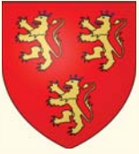
Dordogne Coat of Arms

Experience firsthand the true character and traditions of Dordogne during this comprehensive, small group travel program featuring the beautiful countryside of southwestern France, the medieval village of Sarlat-la-Canéda within the Dordogne's oak-forested Périgord Noir and the world's largest collection of magnificent prehistoric art. Enjoy an enriching travel experience like no other and an excellent value, including all accommodations, specially designed excursions and most meals. Interact with local people and become immersed in the rhythm of daily life in Dordogne; explore the history and culture, art, language and cuisine; and unpack just once! This popular program is one of the VILLAGE LIFE® series, a comprehensive and intimate travel experience at just the right pace.