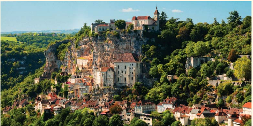
Part of the UNESCO World Heritage St. James’ Way pilgrimage route, Rocamadour has for centuries beckoned travelers to its lofty summit above a tributary of the Dordogne River.

CULTURAL ENRICHMENT: Attend the private, specially arranged presentation by a local expert on preserving medieval architecture in Sarlat.