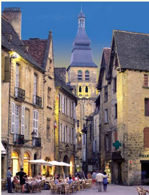
Enjoy two dinners featuring traditional French cuisine at specially selected local bistros.

Petit St-Amand-de-Coly is one of the most picturesque villages in Dordogne, its cobblestone lanes dominated by the fortified 13 th -century Abbey Church,