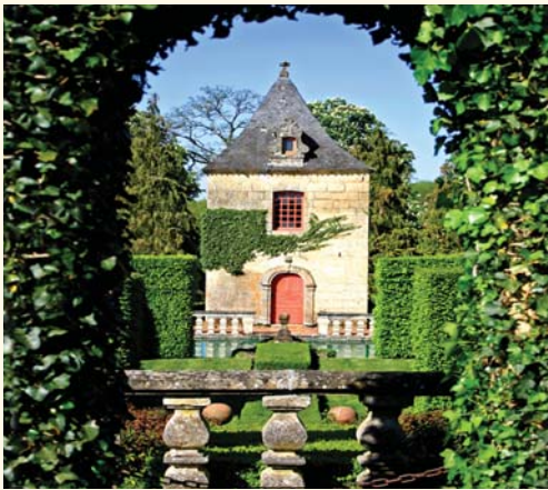
Admire the finest "English" gardens in France as you stroll through the enchanting grounds of Eyrignac Manor.