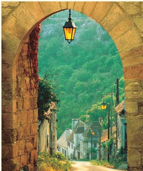
Cover photo: Visit the storied Dordogne River Valley, where brave knights once defended medieval villages.