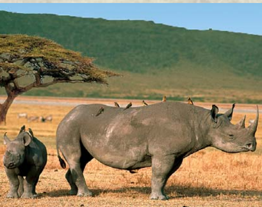
The rare black rhinoceros shares a symbiotic relationship with other creatures of the Ngorongoro Crater.

Early in the morning, board a four-wheel-drive vehicle and descend 2000 feet down to the floor of Ngorongoro Crater, a remarkable sanctuary for hundreds of mammal and bird species, for a morning of game tracking.