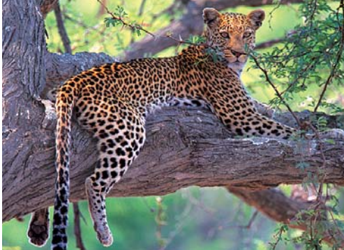
Watch for the elusive leopard, a master of concealment, relaxing on large tree branches.

PRSR STD U.S. Postage PAID Gohagan & Company