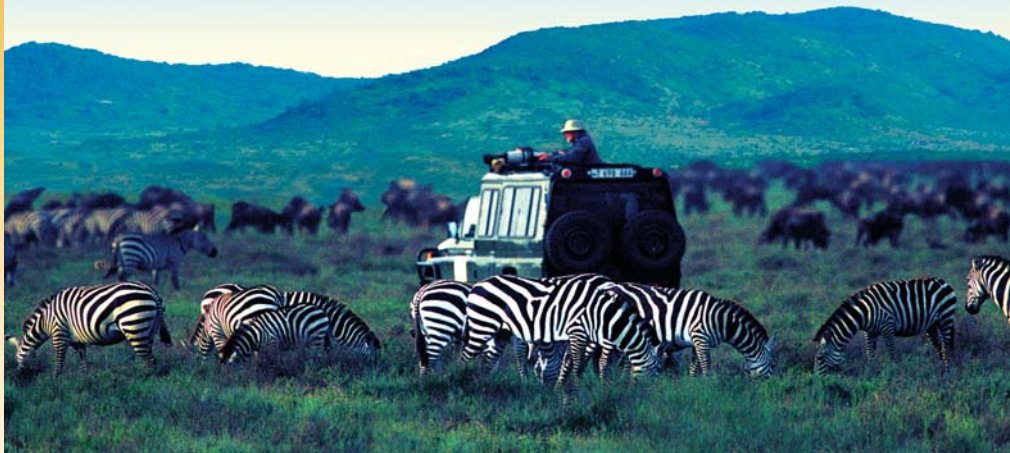
View migrating zebra and wildebeest up close from your safari vehicle on game excursions led by expert guides.

On the edge of the Great Rift Valley, observe firsthand Tanzania's educational system during a stop at Kibaoni Primary School, the first public primary school in Tanzania with a library—visitors to the country donated most of its book collection. Visit with local students and see the school's classrooms.