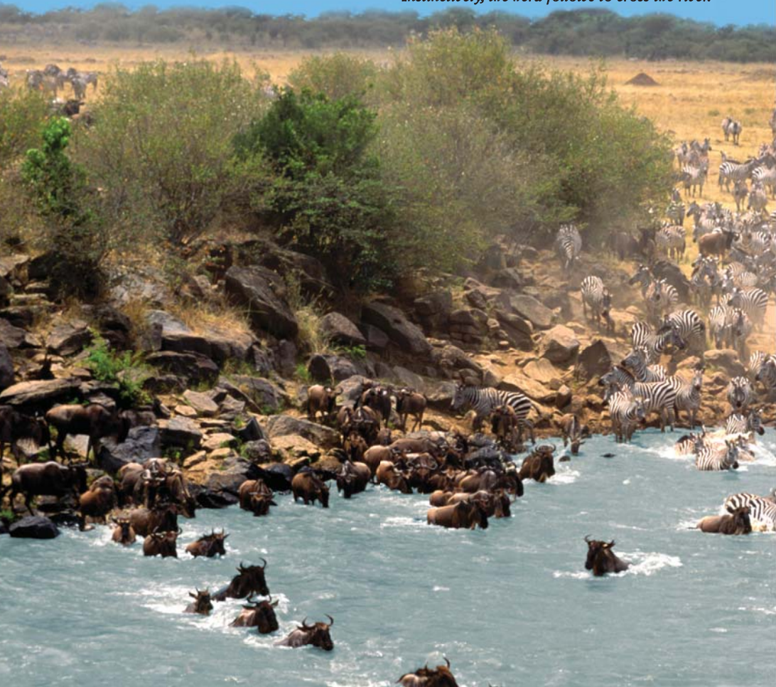
Photo this page: A lone, brave wildebeest finds a favorable crossing point and plunges ahead. Instinctively, the herd follows to cross the river.

Cover photo: Observe the regal magnificence of the African lion from an up-close perspective.