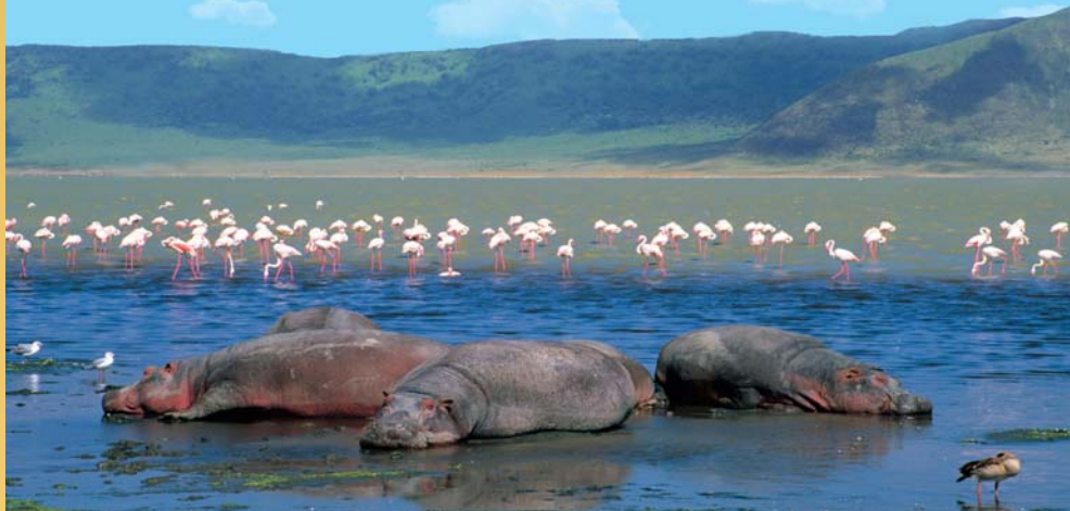
Ngorongoro Crater's wetlands offer a cool sanctuary for a pod of hippopotamuses, which can run as fast as 30 miles per hour and may weigh more than 4000 pounds each.