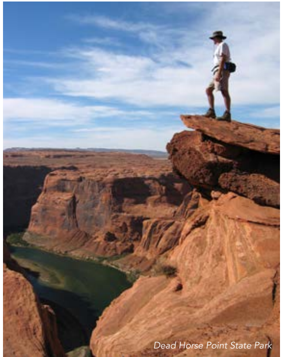
Dead Horse Point State Park

Registration, Deposits and Final Payment. To confirm and secure your reservation, a deposit of $850 per person per program, a deposit for any extension(s), and any non-refundable advanced payments, payable by check, online check/ACH, money order, wire transfer of same day U.S. funds, or major credit card, is due at the time of registration. Final payment, including any extension(s) and optional(s), is payable by check, online check/ACH, money order, or wire transfer of same day U.S. funds ONLY and due no later than 90 days prior to the scheduled program departure date. If your reservation is made fewer than 90 days prior to departure, the entire cost of the program, including any extension(s) and optional(s), is due at the time of registration by check, money order, or wire transfer of same day U.S. funds ONLY. If final payment is not received by Orbridge at least 90 days prior to the scheduled program departure date, (a) the reservation is subject to a late payment fee equal to 2% (or the maximum legal rate, if less) of the total invoice amount, per week until paid in full, and (b) Orbridge may, at any time and with or without notice, cancel your reservation in its sole and absolute discretion. All payments we receive from you are herein defined as "Payments." CST#2098750-40 WST#602828994