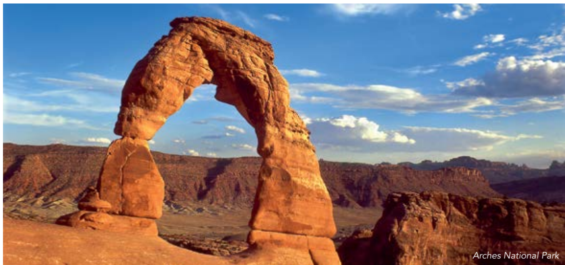
Arches National Park