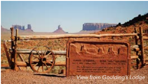
View from Goulding's Lodge