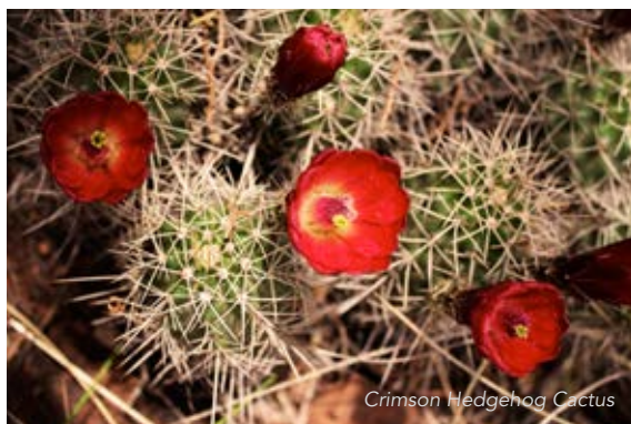
Crimson Hedgehog Cactus

**To be confirmed by National Park Service in 2015