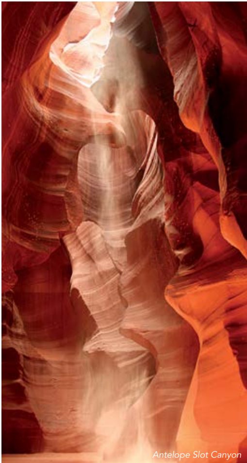
Antelope Slot Canyon