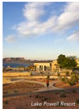
Lake Powell Resort