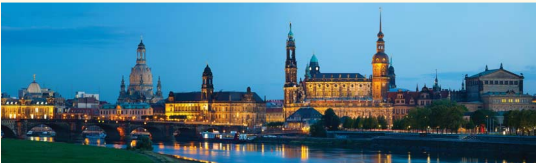
Stroll Dresden’s magnificent promenades along the banks of the Elbe River and admire its architectural treasures, including the impressive Baroque Dresden Cathedral and the elaborate 18 th -century Frauenkirche.

In the 13 th century, to secure his hold of the Elbe River Valley, King Wenceslaus I of Bohemia had this impressive and