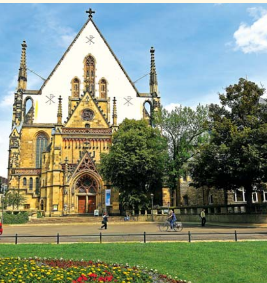
Johann Sebastian Bach is interred at Leipzig's 13 th -century St. Thomas Church, where he served as cantor for 27 years.

nearly impregnable fortress constructed atop a 1000-foot-high mountain overlooking “Saxon Switzerland.” Today, it flanks the German/Czech border and features breathtaking vistas of mountains, dense forests and imposing sandstone cliffs.