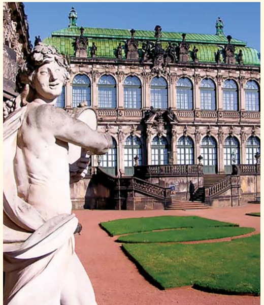
Visit the splendid Baroque Zwinger Palace and its renowned Old Masters Gallery in Dresden.

A fluent German speaker, he has been a Visiting Professor at the University of Munich and has lectured at more than a dozen German and Austrian universities. He has enjoyed extended research leaves in Cologne, Berlin, Freiburg, Würzburg and other university towns and traveled widely throughout Germany. His particular interests in Middle European culture include Wagnerian opera, German Renaissance painting and sculpture, the history of Lutheranism and German regional cuisines.