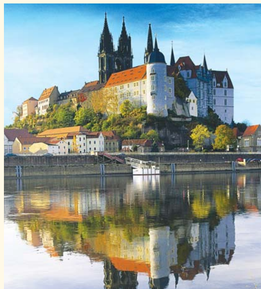
Albrechtsburg’s vast fortified castle has been a symbol of Meissen for more than five centuries.

This historic, charming town on the banks of the Elbe River is best known for Martin Luther, who profoundly changed the Christian world and the course of Western history when he nailed his 95 Theses to the door of the Schlosskirche (“Castle Church”) in 1517. Although the original door is gone, the church still stands and contains the tombs of several historic figures, including Luther himself and the Great Elector, Frederick the Wise,