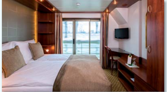
Double cabin with French balcony (floor-to-ceiling sliding glass door).

The professional, international English-speaking crew provides attentive service. The ship is equipped with a state-of-the-art navigation system, meets all safety standards and is ecologically friendly.