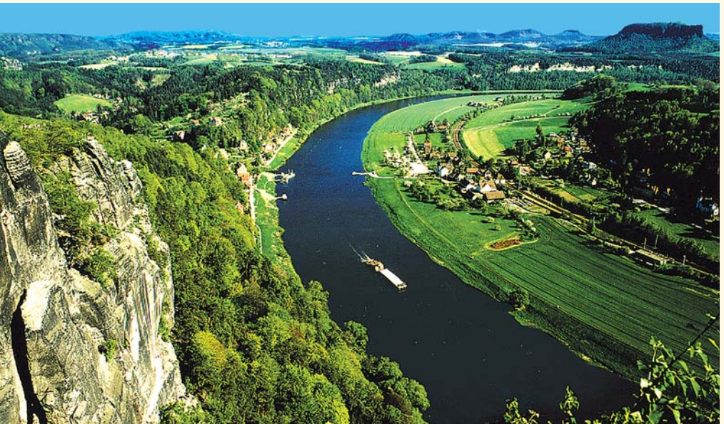
Admire the dramatic cliffs and sweeping landscapes of Saxony's Elbe River Valley, a part of Europe known as the "Saxon Switzerland" for its spellbinding beauty. Inset above: Saxony's coat of arms.