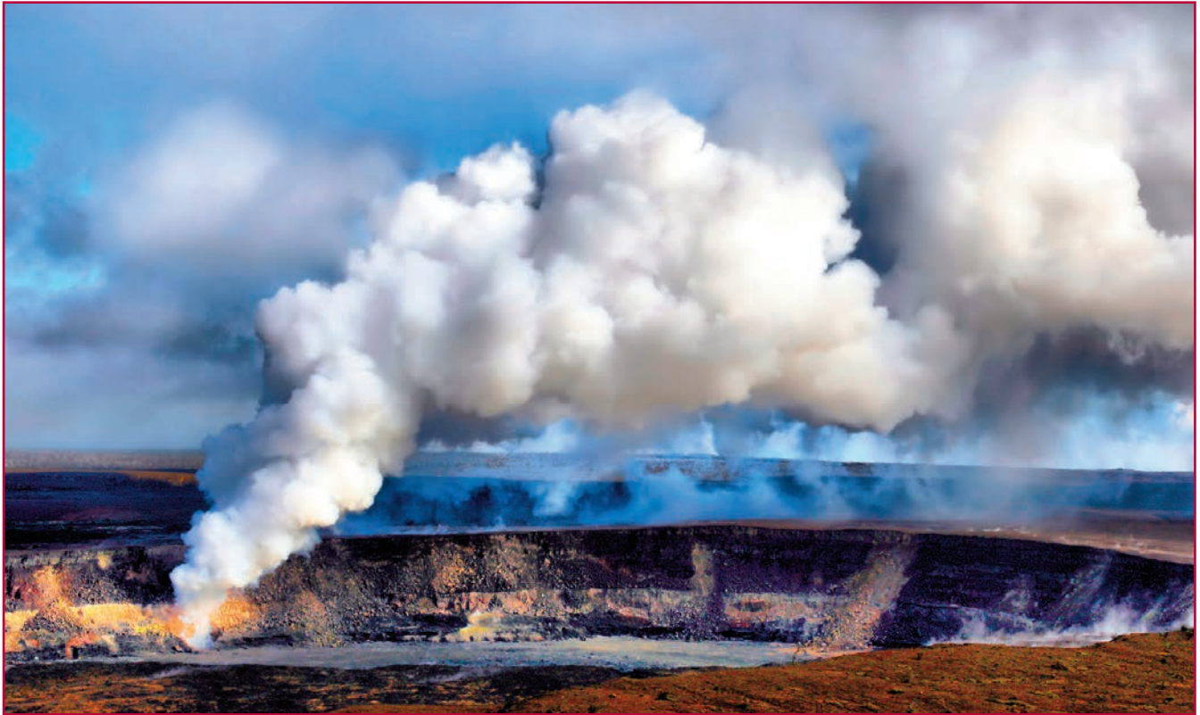
Halema'uma'u Vent, Volcanoes National Park