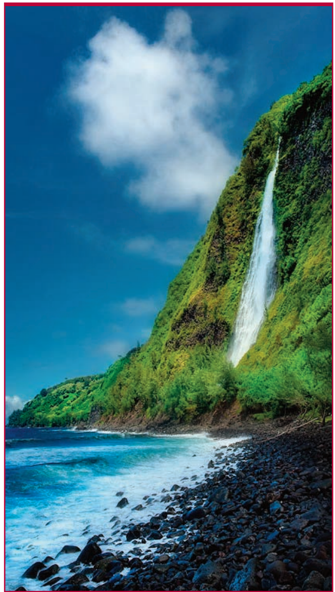
Waipio Valley Beach

In the afternoon, tour the famous "Garden in a Valley on the Ocean," which sits on the lush Hamakua Coast's Scenic Drive. The Hawaii Tropical Botanical Garden is a museum of living plants that attracts photographers, gardeners, botanists, scientists, and nature lovers from around the world. The Garden's collection of tropical plants is international in scope. More than 2,000 species, representing more than 125 families and 750 genera, are found in this one-of-a-kind garden. The 40-acre valley is a natural greenhouse, with fertile volcanic soil, and