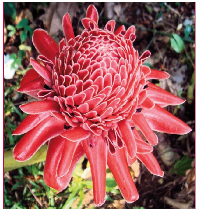
Torch Ginger, Hawaiian Tropical Botanical Gardens