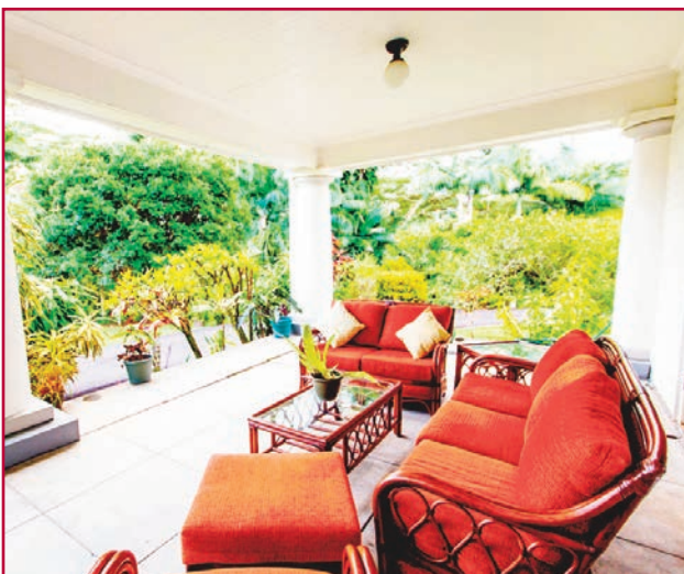
The Lanai (front porch)