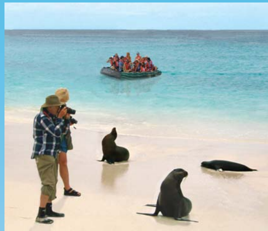
Take photographs of a lifetime during up-close Galápagos wildlife encounters.

Please note that the M.V. SANTA CRUZ's specific itinerary and cruise pattern is dependent on weather, sea conditions and Galápagos National Park Service regulations.