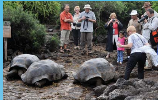
In 1570, the islands were named “galápagos,” meaning tortoise, based on sailors’ descriptions of their inhabitants.

Arrive this morning at San Cristóbal, where Darwin first landed in 1835, and observe the giant tortoises—the largest in