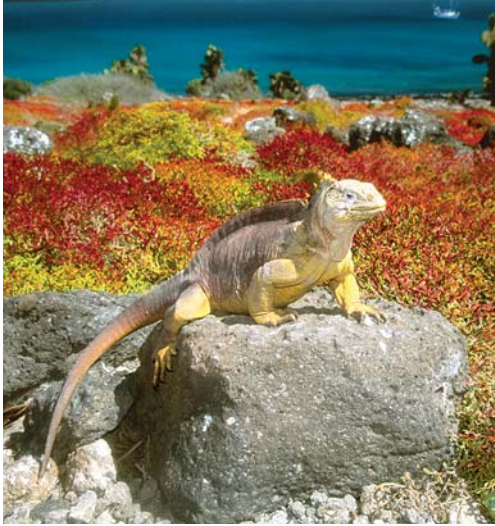
Observe the distinct creatures indigenous to the Galápagos Islands, like this land iguana, the same way Charles Darwin did more than 150 years ago.