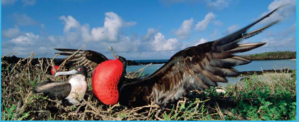
Look for the unique mating “dance” of the magnificent frigate birds, one of the Galápagos Islands’ hallmark species.