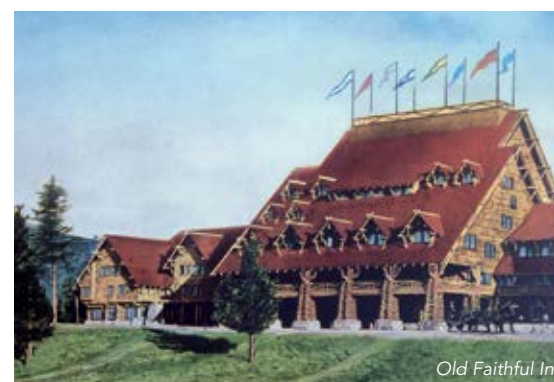
Old Faithful Inn

*May change due to park confirmation and reservation restrictions.