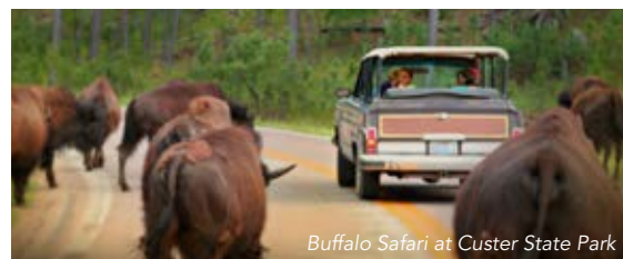
Buffalo Safari at Custer State Park