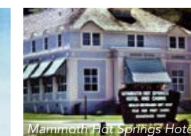
Mammoth Hot Springs Hotel