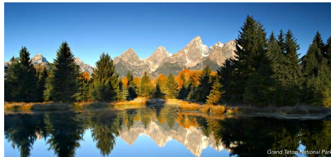
Grand Teton National Park