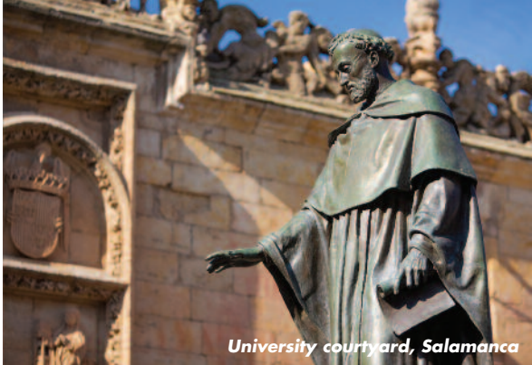
University courtyard, Salamanca