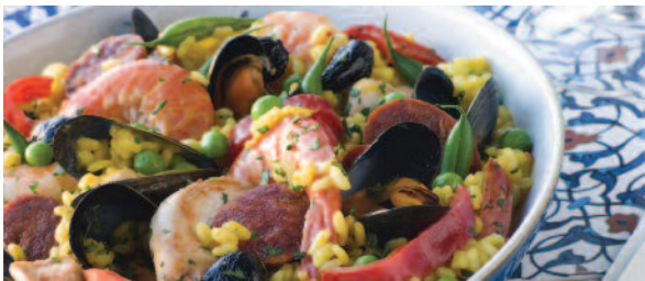
Clockwise: Gardening lettuce | Spanish tapas | Castilian chickpea salad | Traditional paella meal Below right: Sangría