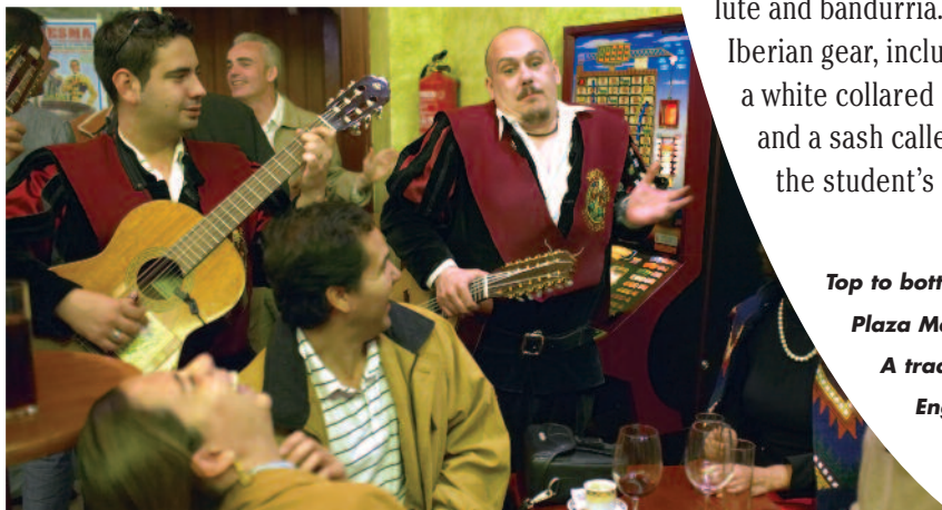
Top to bottom: Castilian-speaking Spaniards Plaza Mayor, Salamanca