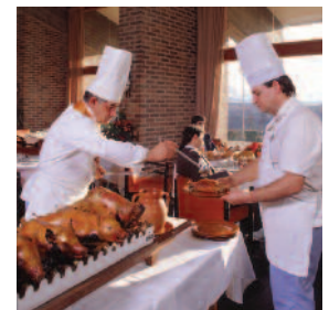
Below: Chefs preparing a suckling pig dinner, Segovia

may choose to visit the Prado Museum, take a walk through Retiro Park or simply reflect on your time living in Spain as you relax at a café on the Plaza Mayor.