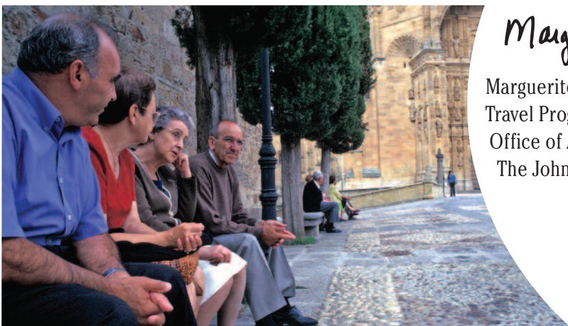
Snippets of Salamanca: University building façade | Libreros Street | Friendly locals