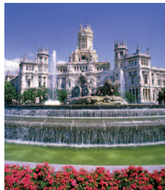
Post Office, Madrid

One of Europe's premier cultural capitals, Madrid rarely sleeps. The capital of Spain has grown from humble beginnings into an international crossroads abundant in world-class nightlife, fashion, art, music and cuisine. The city practically buzzes with the enthusiasm of the madrileños, Madrid residents, who migrate from all over the world to savor the cosmopolitan Spanish lifestyle.