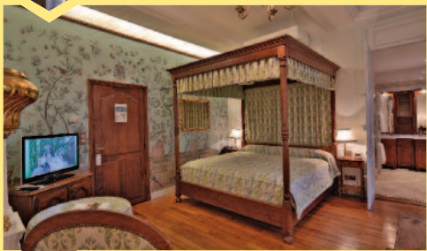
HÔTEL LE CEP BEAUNE

A member of the prestigious Small Luxury Hotels of the World association, the Hôtel Le Cep is a romantic hideaway located within Beaune's historic ramparts. The boutique hotel features modern guest rooms with Wi-Fi, an elegant garden, a fitness center, a hotel bar and the gourmet, Michelin-starred Loiseau des Vignes. In 2012, the readers of Travel + Leisure magazine listed the Hôtel Le Cep as one of the world's 500 best hotels.