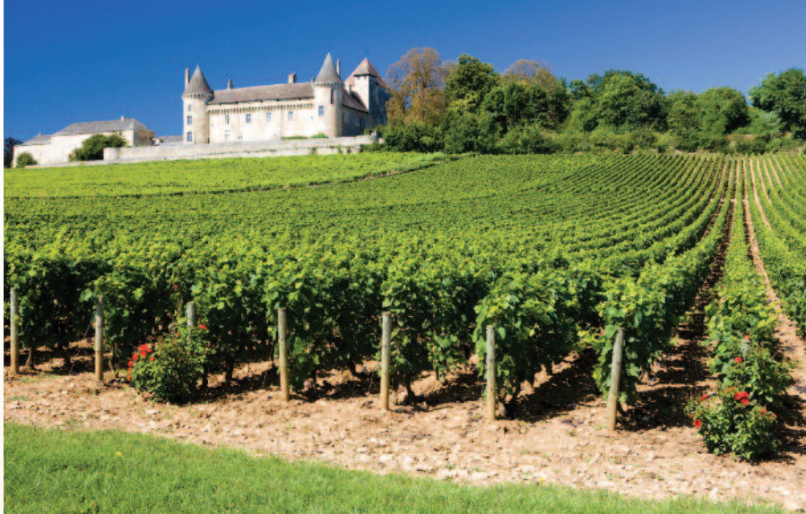
Right: Château de Rully