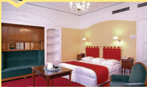
HÔTEL CARLTON LYON LYON

Opened in 1894 and located on Lyon's famous Presqu'île, the historic Hôtel Carlton is ideally situated for exploring restaurants, museums, shops and the city's landmarks. It also is conveniently located near a metro stop. Sip a Rouge Carlton, the signature cocktail at the hotel's bar, before striking out to explore the sophisticated capital city of French cuisine. The hotel also has a spa with a hammam, a Turkish bath. Wi-Fi is available throughout the hotel.