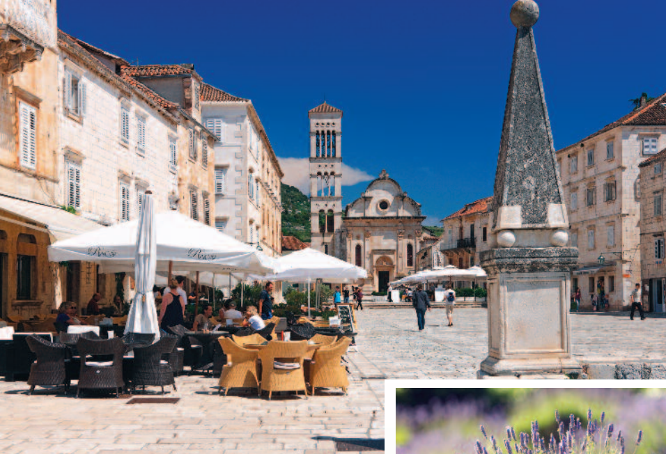
Left: St. Stephen's Cathedral and Square, Hvar