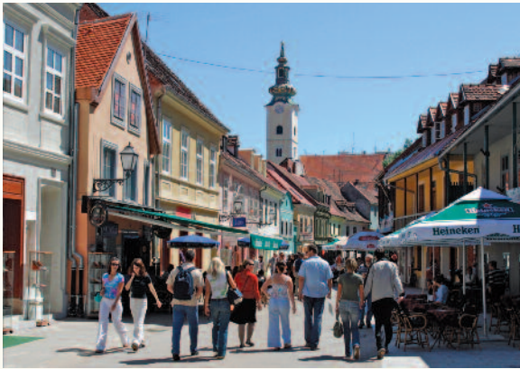
Top: Dubrovnik harbor | Inset: Croatian folk musicians | Lower left: Statues, Diocletian's Palace | Above: Zagreb

between the sparkling Sava River and the forested slopes of Mount Medvednica, the city of Zagreb awaits you. Stroll the narrow, winding streets and admire the city's rich array of Austro-Hungarian architecture. At the heart of Zagreb's beautifully preserved Upper Town, visit iconic St. Mark's Church. Originally erected in the 13th century, its brilliant tile mosaic roof depicts the Croatian, Dalmatian, and Slavic coats of arms as well as those representing Zagreb.