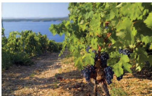
Left: The ruins of Diocletian's Palace, Split Upper: Seaside promenade, Trogir Lower: Coastal vineyards, Hvar