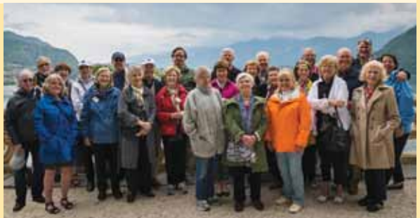
Italian Lake District 2013