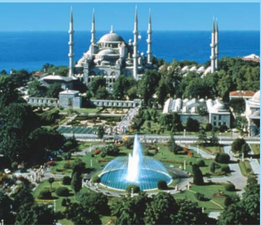
The splendid and graceful Blue Mosque lies between lovely Sultanahmet Park and the Sea of Marmara.

harbor, a naturally created caldera, beneath which is believed to be the legendary Atlantis, possibly lost during a cataclysmic volcanic eruption in the 16<sup>th</sup> century B.C. A cable car descends to sea level from the elevated town of Fira, whose stunning white walled buildings stand in stark contrast against the dark volcanic cliffs. On the southern end of Santorini lie the recently excavated (1967) phenomenal ruins of Akrotiri. Held intact by layers of pumice and ash for over 3,500 years, Akrotiri's streets reveal the artistry of its mysterious Minoan inhabitants.