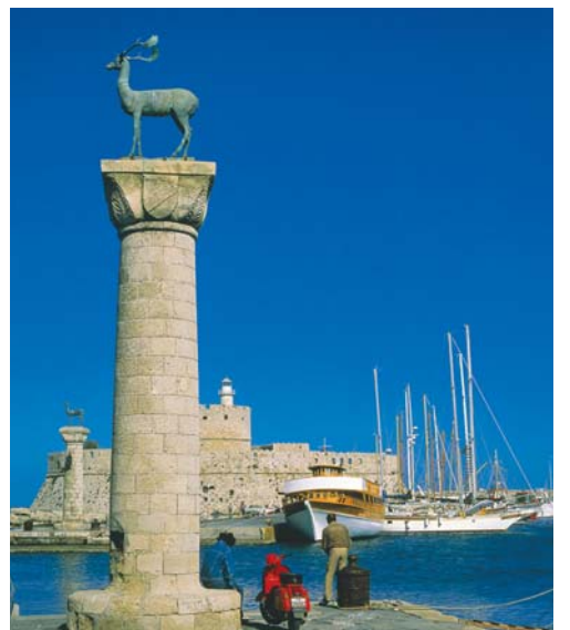
The bronze stag symbolizes the Colossus of Rhodes, one of the Seven Wonders of the Ancient World.

Cover Photo: Admire the beauty of Santorini's volcanic cliffs and whitewashed villages overlooking the deep turquoise waters of the Aegean Sea.