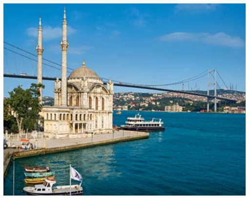
The spectacular Bosphorus Bridge in Istanbul spans between the two continents of Europe and Asia.