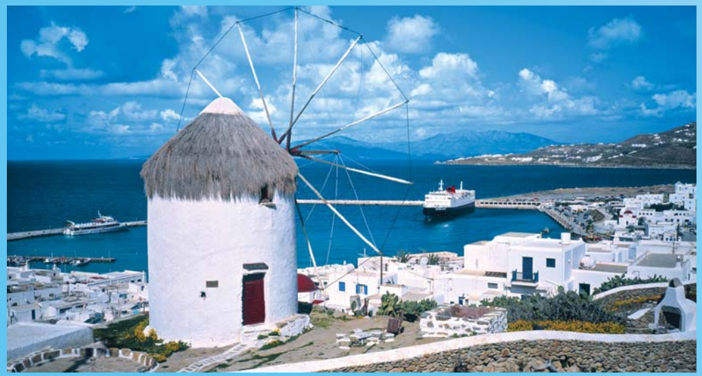
Historically used to mill wheat, Mykonos' iconic round windmills contributed significantly to economic prosperity on the island between the 17<sup>th</sup> and 19<sup>th</sup> centuries. Inset above: Greece's incomparable Parthenon on the Acropolis.

Scheduled guest speaker may be altered due to circumstances beyond our control. See Terms and Conditions.