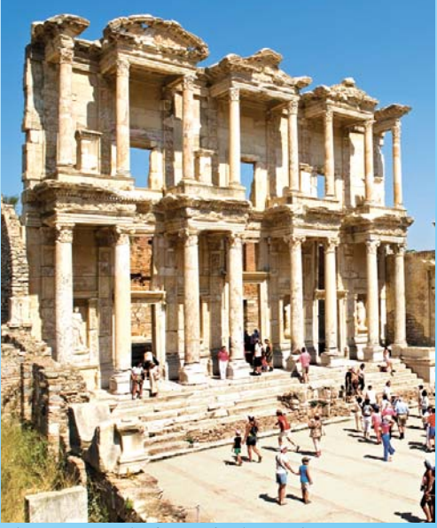
The monumental Library of Celsus, Ephesus, was a repository for more than 12,000 scrolls 1800 years ago.

This legendary metropolis straddling the Bosphorus Strait is the only city in the world that naturally bridges two continents: Europe and Asia. Its historic treasures are designated a UNESCO World Heritage site and include the magnificent Hagia Sophia, Topkapi Palace and the Blue Mosque.