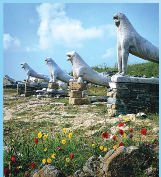
Explore the art and architecture of Delos, such as these lions, masterfully crafted in 600 B.C.

ISTANBUL OF CAPPADOCIA AND ISTANBUL POST-CRUISE OPTIONS