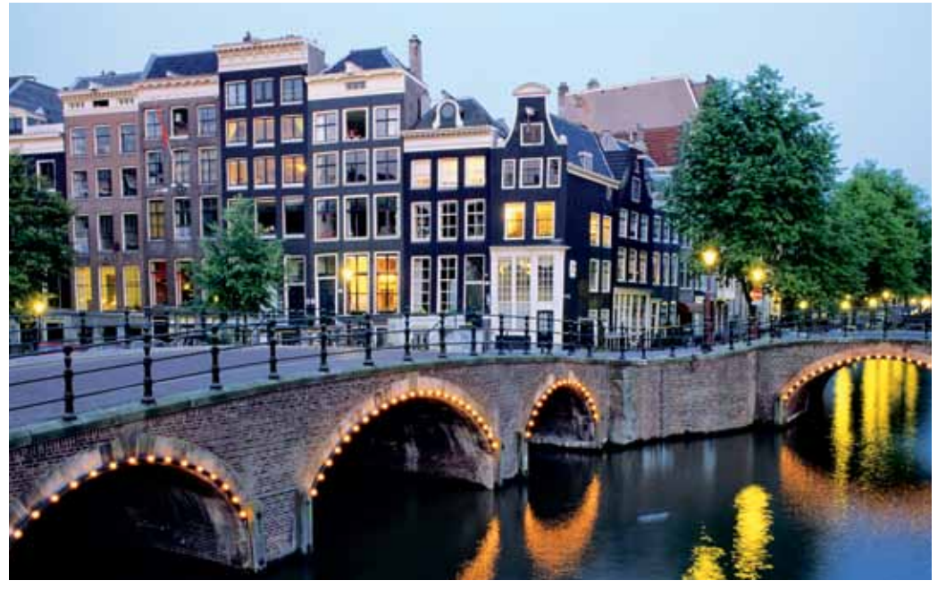
Enjoy sightseeing in the canal-laced capital city of Amsterdam on Days 2-4.