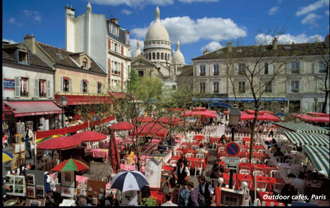
Outdoor cafés, Paris