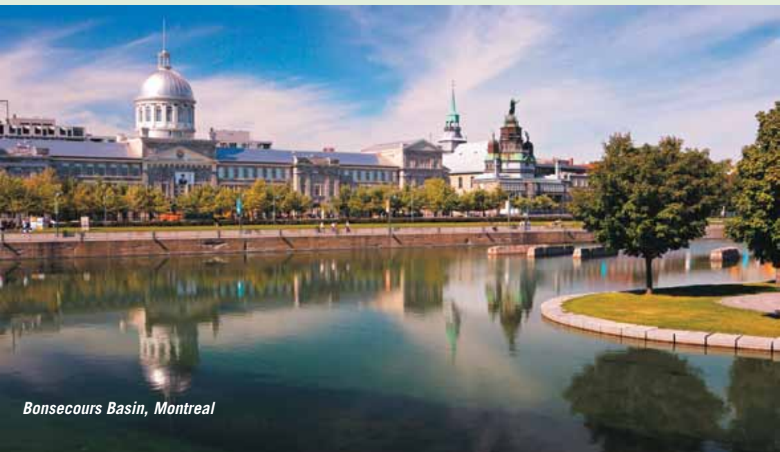
Bonsecours Basin, Montreal