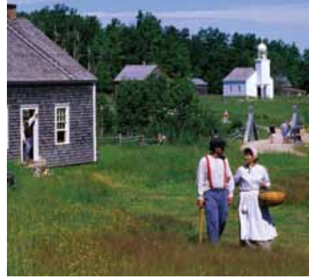
Caraquet's Village Historique Acadien