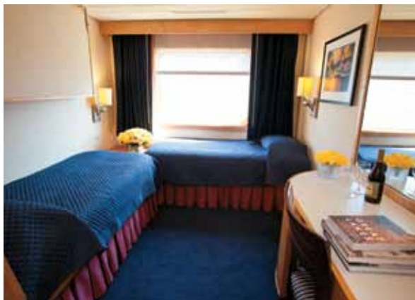
Most cabins feature a picture window