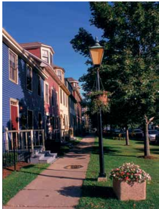
Great George Street in Charlottetown

The 18 th -century village of Lunenburg is known for seafaring and natural beauty. Take a walking tour of the Old Town (a UNESCO World Heritage site) and also visit the aquarium at the Fisheries Museum of the Atlantic. (B, L, D)