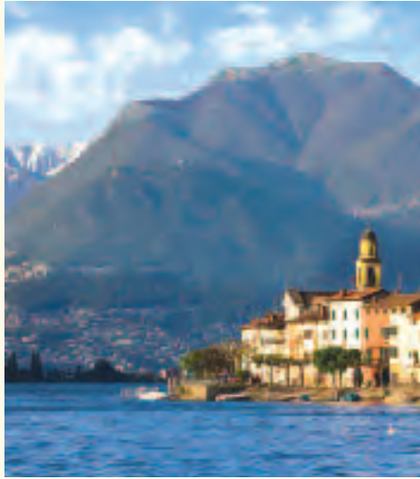
A funicular ride to the top of Switzerland's Monte Brè offers magnificent views of the resort towns of Lake Lugano.

and small family-owned shops to the Piazza Cavour and the tranquil lakeside promenade. The Piazza del Duomo, considered to be the most beautiful cathedral in Lombardy, took nearly 400 years to complete and reflects a seamless blend of Gothic and Renaissance styles.