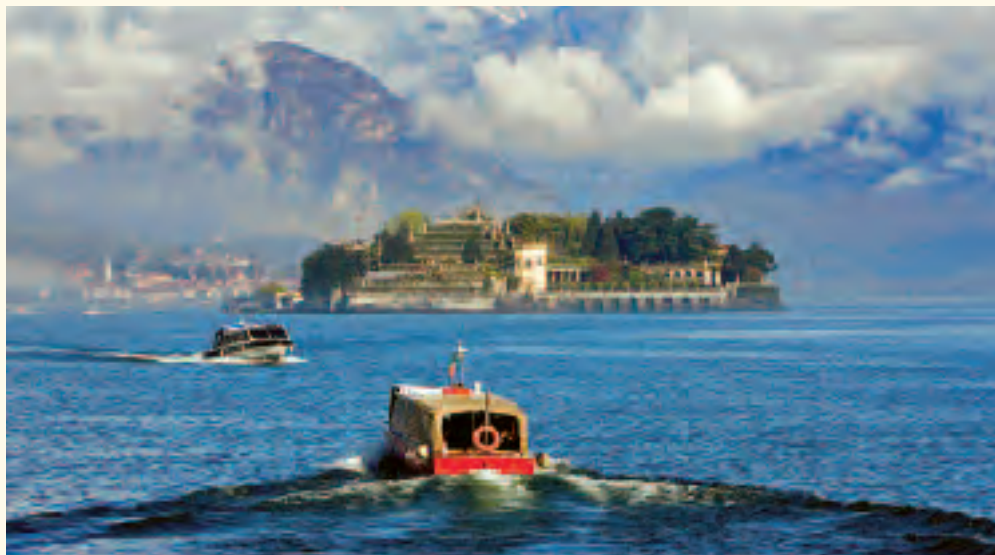
Isola Bella is the most spectacular of the three Borromean Islands, located on the Italian side of Lake Maggiore. Visit the magnificent 16th-century villa and stroll through one of the most beautiful gardens in the world.

Founded by the Romans in 196 B.C., Como’s cobblestoned passages wind past medieval towers and walls, Renaissance palaces and churches, Neoclassical 19 th -century villas,