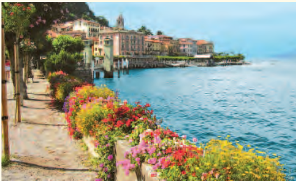
Visit picturesque Bellagio, a splendid combination of fin-de-siècle architecture and stunning panoramic views of Lake Como and the majestic Alps. Inset above: Statue at Villa del Balbianello.