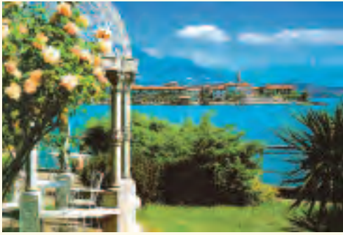
Picturesque lakes, Alpine views and grand villas define the beauty and charm of Lake Maggiore.