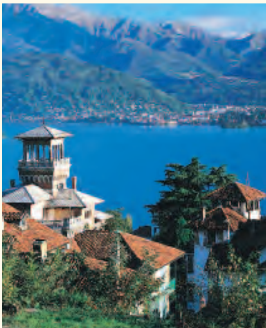
The beautiful town of Stresa on Lake Maggiore has beckoned European aristocracy for centuries.

From the deep-blue glacial lakes of Maggiore and Como to the bewitching Villa del Balbianello, from the medieval cobblestoned streets of Varenna to the modern sophistication of Milan, discover the exquisite gem that is the Italian Lake District.