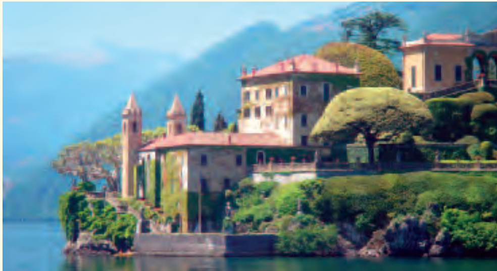
Nestled on the shores of Lake Como and surrounded by majestic Alpine peaks, the legendary Villa del Balbianello has one of the most beautiful and dramatic settings in all of Italy.