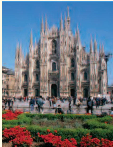
Visit Milan’s towering Duomo on the Pre-Program option, home to some of Italy’s finest religious art.

Cruise among Lake Maggiore’s Isola Bella, Isola di San Giovanni, Isola Madre and Isola dei Pescatori, collectively known as the Borromean Islands, named after the powerful and influential Borromeo family.